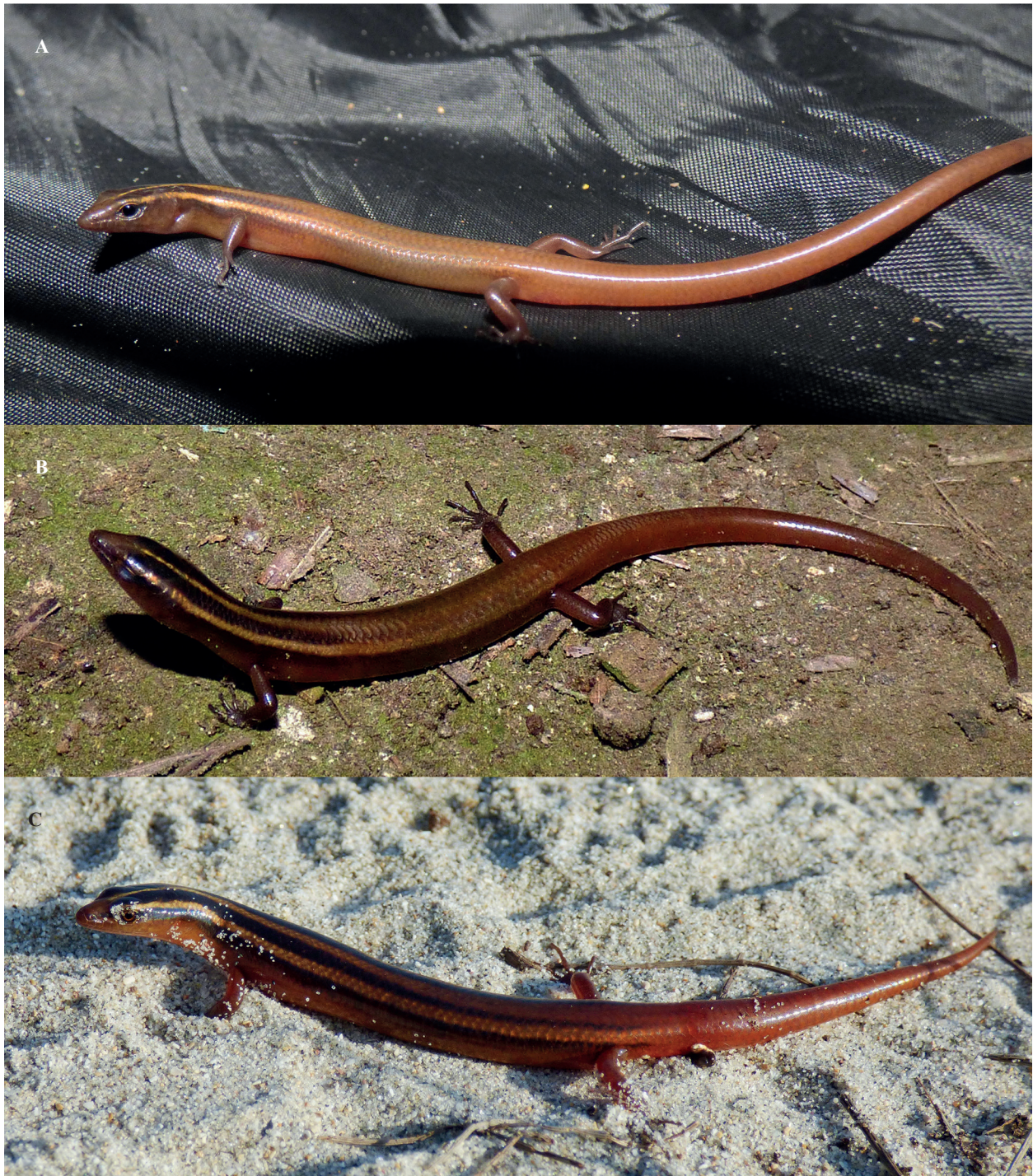
Fig. 1. Lipinia macrotympanum in life. A–B. ZSI/ANRC/T/4330 from Galathea. C. ZSI/ANRC/T/3709 from Shastri Nagar.

reported herein has not been known until now. Illustration of this species published by Das (2002) conforms to the coloration of ZSI/ANRC/T/3709.