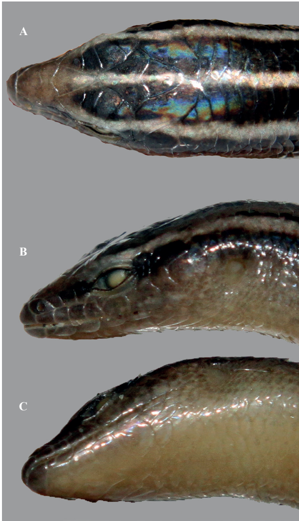
Fig. 2. Head of Lipinia macrotympenum ZSI/ANRC/T/3709. A. Dorsal view. B. Lateral view. C. Ventral view.

the specimen collected (ZSI/ANRC/T/4330) was found resting under a dry palm leaf post noon at ca. 15:18 h. The third, uncollected individual was found foraging on the ground, at the camp site near the tent in Feb 2016. This region (Galathea) is surrounded by Casuarina groves bordering a stretch of a sandy beach near the Galathea River delta. The habitat of this region is generally characterized by reduced canopy cover, low leaf-litter and sandy soil situated close to the sea coast with strand vegetation.