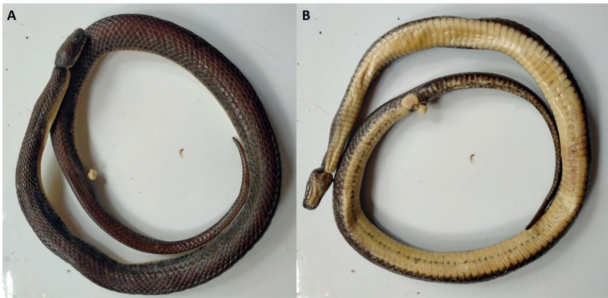
Fig. 2. Trimerodytes yapingi (Guo, Zhu & Liu, 2019) (NUOL R.2020.15), adult male (preserved) from Laos. A. Dorsal view. B. Ventral view.

ensis Rao & Yang, 1998 and T. aequifasciatus (Barbour, 1908) with a bootstrap value of 72. Within clade A, Trimerodytes praemaxillaris Angel, 1929 and T. yapingi Go,