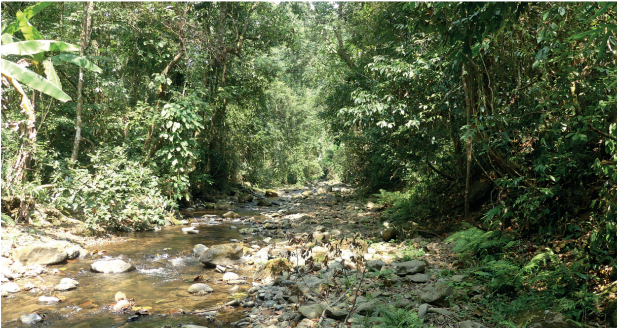
Fig. 4. Habitat of Trimerodytes yapingi (Guo, Zhu & Liu, 2019) in Phon Song Village, Xon District, Houaphan Province, north-eastern Laos.