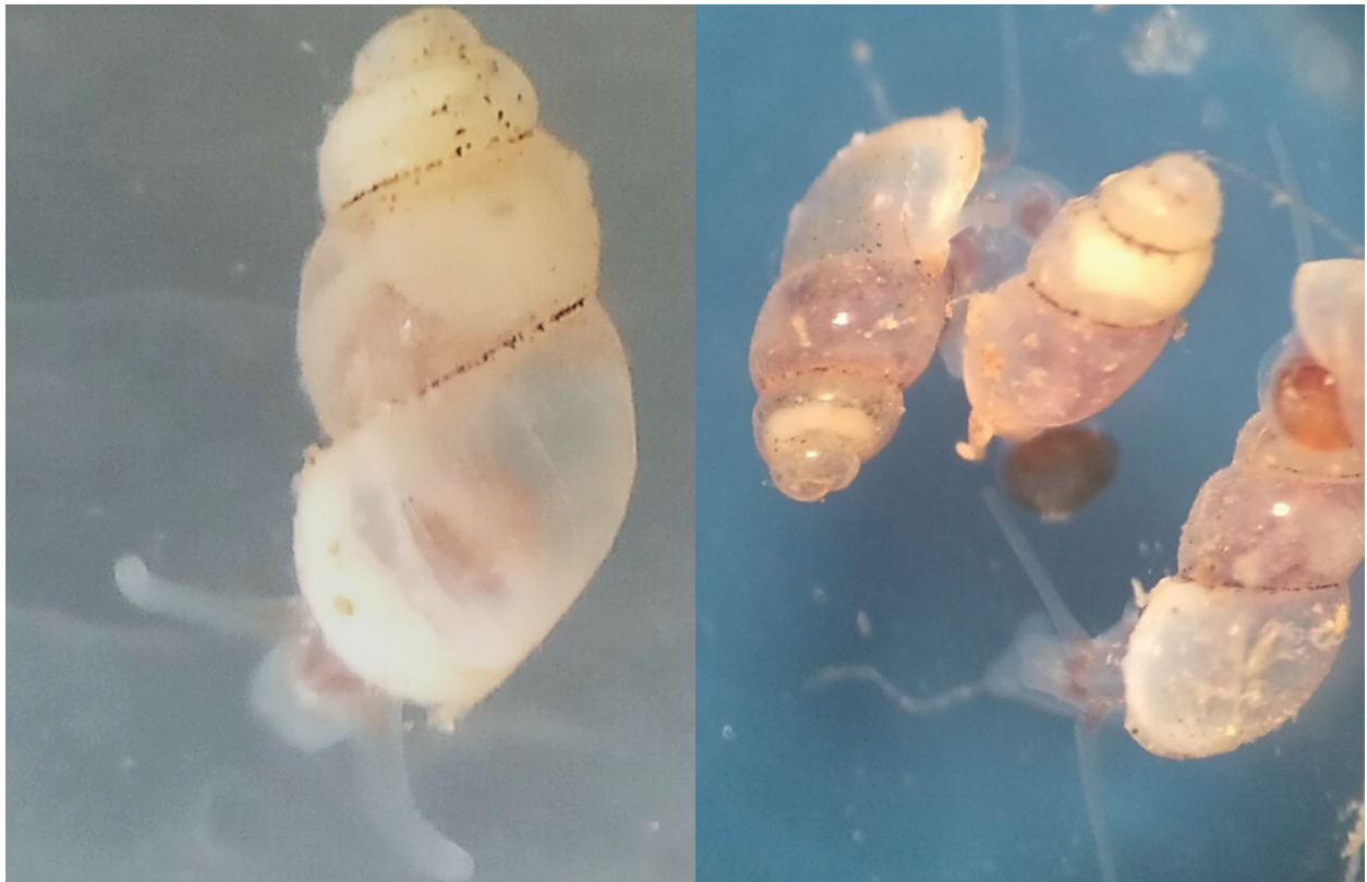
Fig. 6. Habitus of live specimens of Mahrazia benlemlihi gen. et sp. nov.