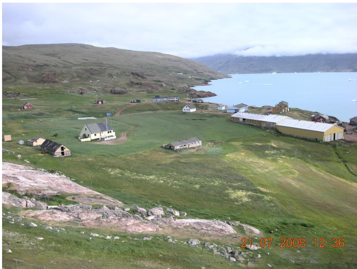
Fig. 3: Sheep farming area of Brattahlid (Eastern Settlement) in South Greenland with barley fields, meadows and grazing areas. Fred J.A. Daniëls, July 2008.

Greenland date from the last three decades. One of these is the Arctic Biodiversity Assessment (MELTOFTE 2013) some results of which are dealt with here.