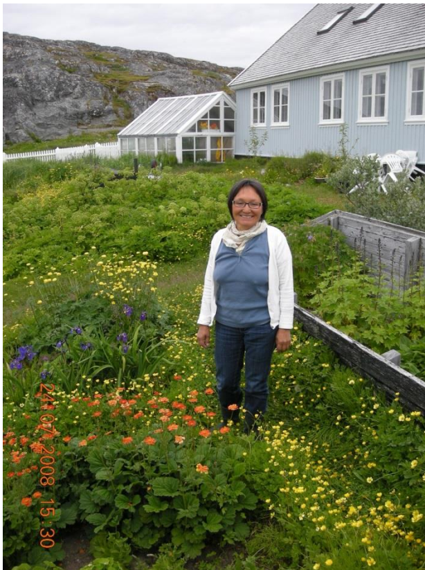
Fig. 4: Garden with ornamental plants and vegetables in Nuuk, West Greenland. Fred J.A. Daniëls, July 2008.

In their analyses of the vascular plant flora of Greenland BÖCHER et al. (1959) already showed the high percentages of introduced species in the floras of S and SW Greenland, 12 % and 20 %, respectively. These high percentages are clearly related to the relatively strong habitation of these parts of Greenland. Also Tab. 2, 3 indicate that the number of stabilized introductions (*) is much higher in GW (50; 49 in Tab. 3) than in GE (5). The same applies to the casual introductions (**), 26 and 4, respectively.