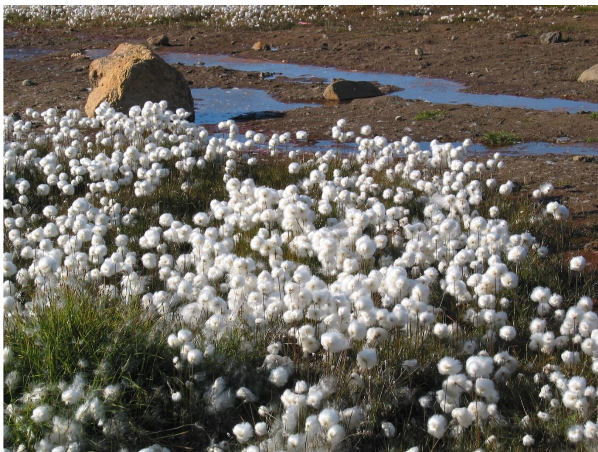
Fig. 5: Luxurious Eriophoretum scheuchzeri Fries 1913 on nutrient-rich soil near soccer field in Tasiilaq, Southeast Greenland. Fred J.A. Daniëls, July 2009.

Human influence in and around towns and settlements on flora and vegetation mainly results in habitat disturbance and eutrophication. The latter results in vigorous growth of plants such as in Oxyria digyna , Polygonum viviparum , Cerastium alpinum , Saxifraga cernua , Taraxacum croceum , Rhodiola rosea , Eriophorum scheuchzeri and in grasses such as Poa alpina , Alopecurus alpinus and Phippsia algida (see also KRUISE 1912). In smaller settlements vigorous stands of for example Eriophoretum scheuchzeri Fries 1913 (Fig. 5) and Cerastio-Saxifragion Hartmann 1980 vegetation (also known from bird-cliffs) are common.