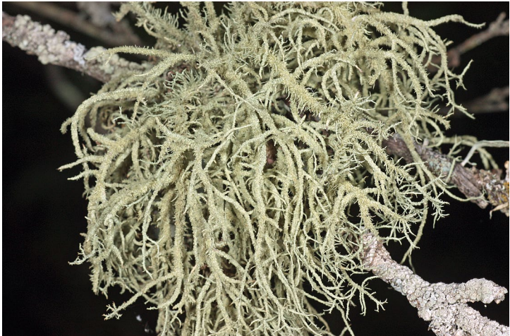
Figure 10. Usnea leprosa on dead twigs (width ca. 9 cm).