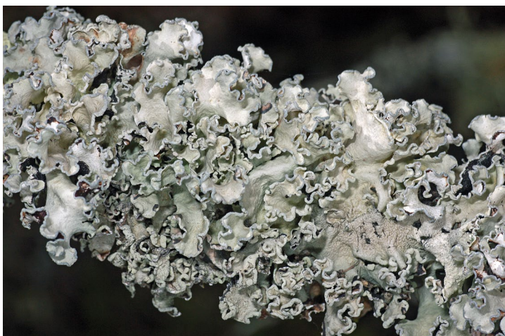
Figure 7. Parmotrema austrosinense on twigs of shrubs (width ca. 8 cm).