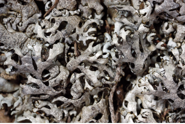
Figure 26. Xanthoparmelia prolata (width 2.1 cm).