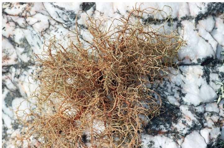
Figure 11. Usnea rubicunda on quartz rock (width ca. 10 cm).