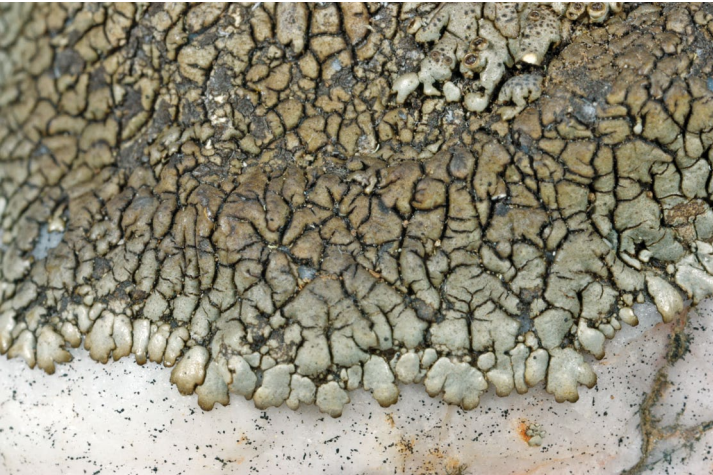
Figure 28. Xanthoparmelia xantho-melanella (width 2.1 cm).