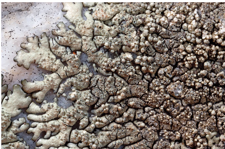
Figure 14. Xanthoparmelia capensis (width 2.1 cm).