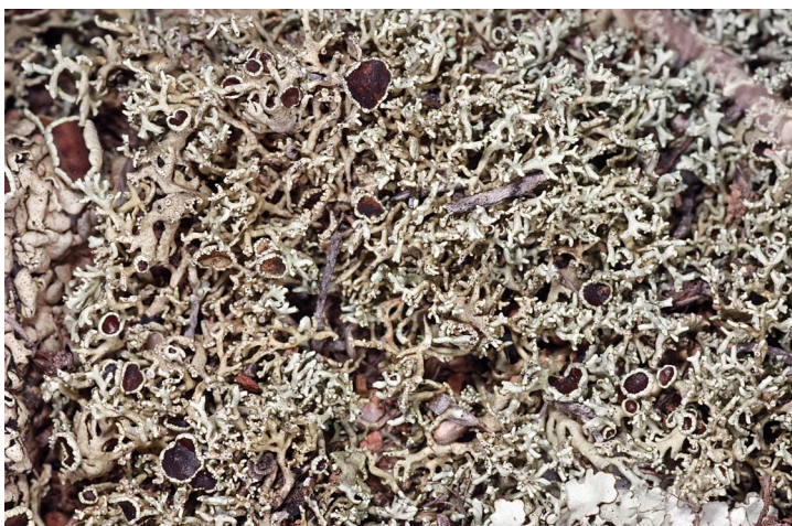
Figure 22. Xanthoparmelia molliuscula (width 4.2 cm).