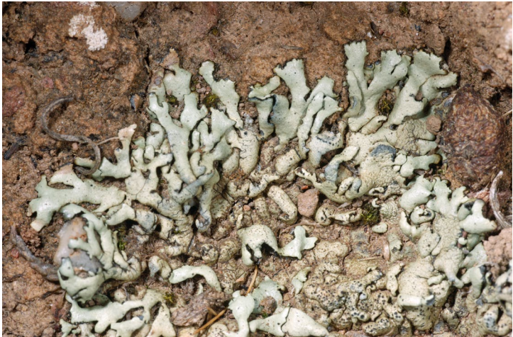
Figure 19. Xanthoparmelia hypopsila (width 2.8 cm).