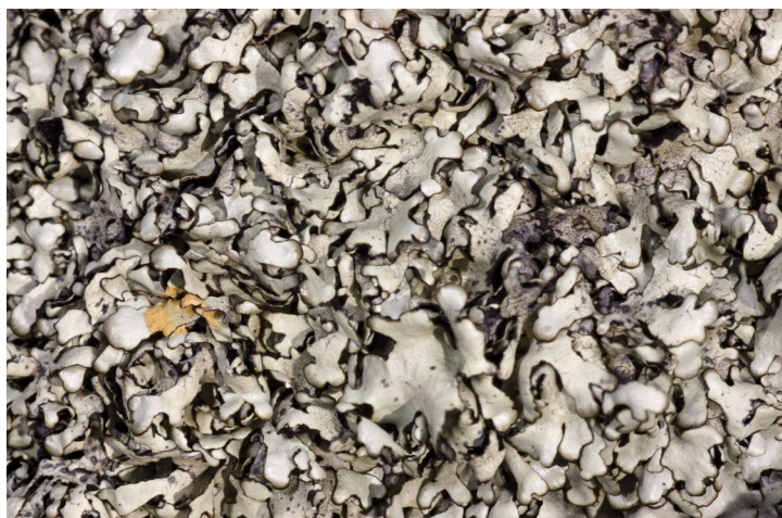
Figure 24. Xanthoparmelia phaeophana (width ca. 10 cm).