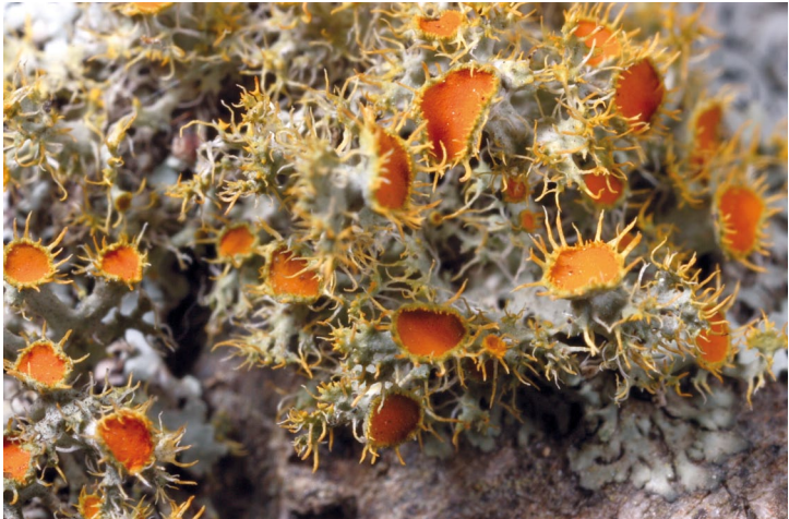
Figure 9. Teloschistes chrysophthalmus (width 2 cm).