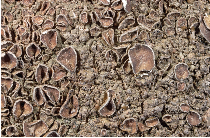
Figure 17. Xanthoparmelia glabrans (width 2.1 cm).