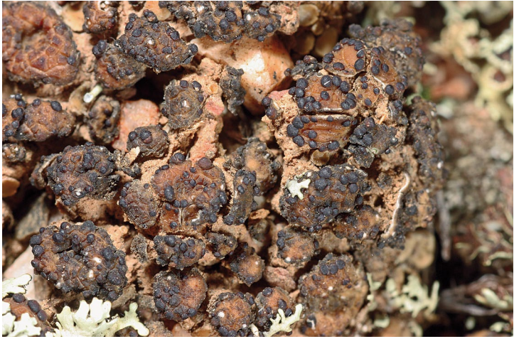
Figure 8. Psora aff. crenata on loamy earth (width 2.1 cm).