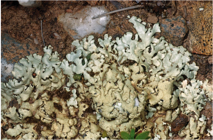
Figure 18. Xanthoparmelia gyrophorica (width 4.8 cm).