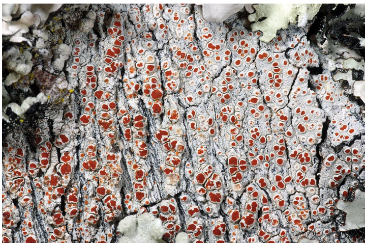
Figure 5. Haematomma persoonii on stems of little trees (width ca. 3.8 cm).