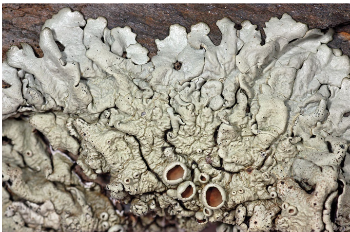
Figure 15. Xanthoparmelia chalybaeizans (width 3.7 cm).