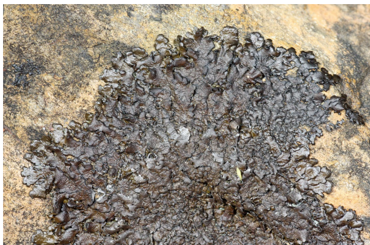
Figure 13. Xanthoparmelia cafferensis (width 2.1 cm).