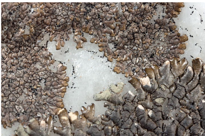
Figure 16. Xanthoparmelia condyloides (below) and X. cf. substenophylloides (width 1.1 cm).