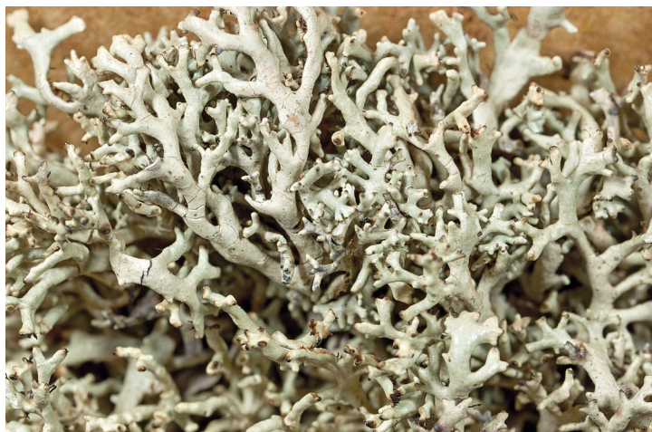
Figure 12. Xanthoparmelia amphixanthoides (width 2.1 cm).