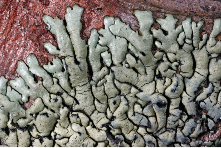
Figure 27. Xanthoparmelia wa-boomsbergensis (width 1.8 cm).