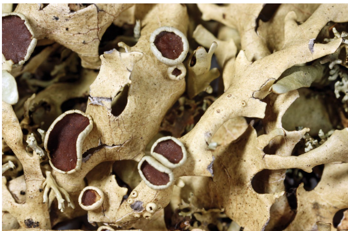
Figure 20. Xanthoparmelia leonora (width 2.1 cm).