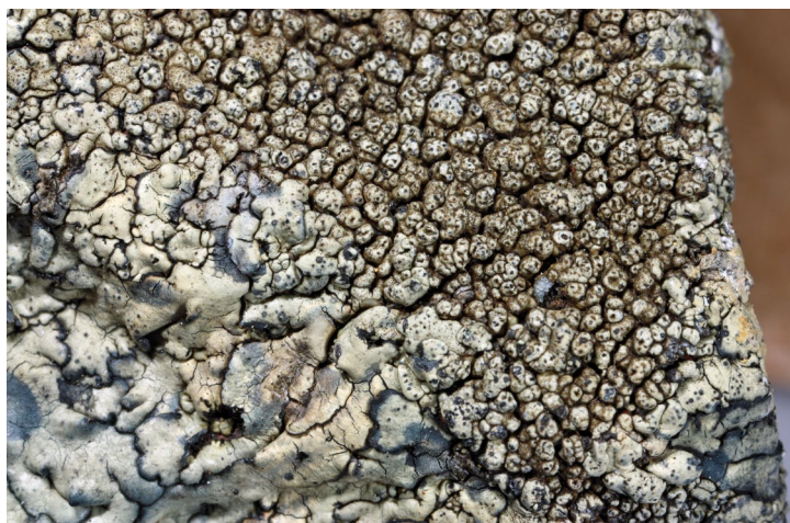
Figure 25. Xanthoparmelia prodromosii (width 2.1 cm).