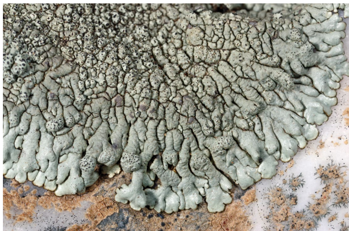
Figure 23. Xanthoparmelia perplexa (width ca. 4 cm).