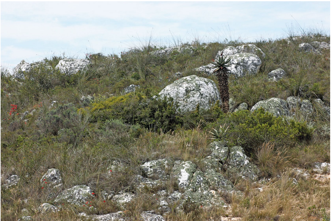
Figure 1. Renosterveld vegetation near Haarwegskloof Research Center northeast of Bredasdorp (Western Cape) with quartz boulders and Aloe arborescens .

In order to collect a representative sample of the lichen biodiversity of the area, we collected specimens over three short visits to the reserve (October 2015, August and October 2017) from soil, rock and vegetation. The samples were investigated by thin layer chromatography (H. SIPMAN, M. HEKLAU) following ORANGE et al. (2001), except those which were confidentially determinable in the field such as Teloschistes species, Ramalina celastri , Physcia adscendens , Ph. jackii and Ph. erumpens . For determination of the species of Xanthoparmelia s.l., by far the most important genus in open biota of the Cape region, HALE (1987, 1989, 1990), ELIX (1994, 1997, 1999, 2002), and ESSLINGER (1977, 1986, 2000) were used, for other genera mainly SWINSCOW & KROG (1988), for Physciaceae MOBERG (2004), for Buellia s.l. MARBACH (2000), for Diploschistes