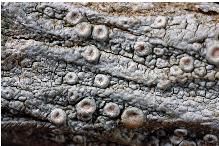
Figure 6. Ochrolechia africana on twigs of shrubs (width 1.1 cm).