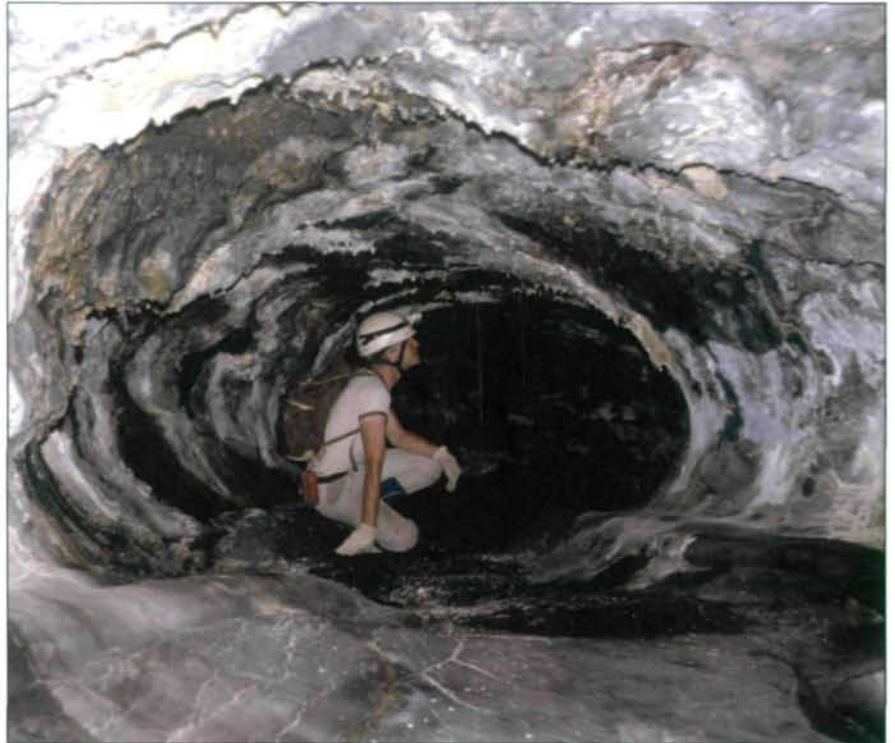
Fig. 5: Lava tube interior

gately cavernicolous Fulgoromorpha species have been found in open lava tubes and limestone caves, may be a collectors' bias, and it is well conceivable that small voids and cracks in the mesocavernous rock system, largely inaccessible to human exploration, are the main habitat, and cave planthoppers only venture into „caves“ when the other conditions are replicated (HOWARTH 1983).