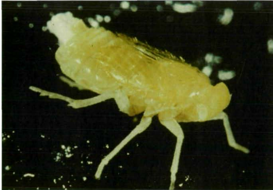
Fig. 2: Oliarus polyphemus , nymph in cocoon on Metrosideros root