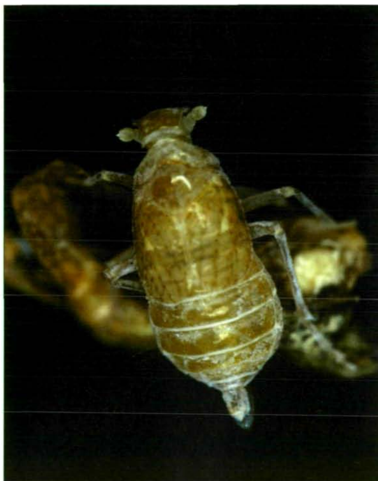
Fig. 8: Tachycixius lavatubus , Canary Islands, habitus

Most of the existing information on the biology and ecology of cavernicolous Fulgoromorpha stems from research on a single taxon: the cixiid genus Oliarus on Hawaii (HOWARTH 1973, 1981; HOCH & HOWARTH 1993, 1999; HOCH & HOWARTH, unpublished data).