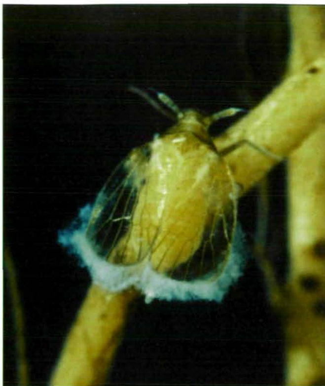
Fig. 7: Solonaima baylissa , Australia, habitus