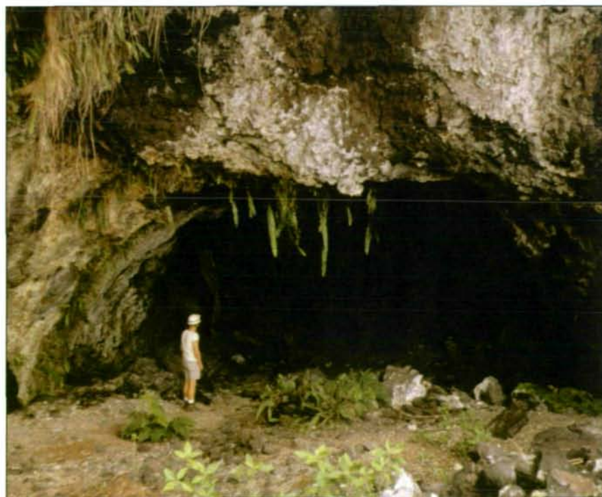
Fig. 4: Entrance of Hawaiian lava tube

Generally, adaptation to similar environments has led to amazingly similar evolution-