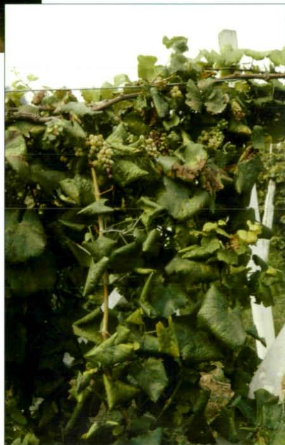
Fig. 8: Grapevine affected by the phytoplasma disease transmitted by Hyalesthes obsoletus (SIGNORET).

The 5th instar nymph is 3.20-3.40 mm long. The body is stocky, uniformly creamy-white. The eyes are red. The antennae are filiform and colourless. The end of the abdomen is crowned by rays of white wax that are as long as the half of the body.