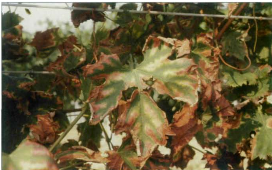
Fig. 2: Common symptoms on the leaves caused by Empoasca vitis (GOETHE).

grapevine in the months of April and May. The females lay an average of 50 eggs in the leaf stalk and in the main veins. This species colonizes the lower page of the leaves, leaf stalks and young growing shoots. In the months of October and November the adults destined to overwinter move into the winter hostplants infesting the neighbouring areas of the vineyards.