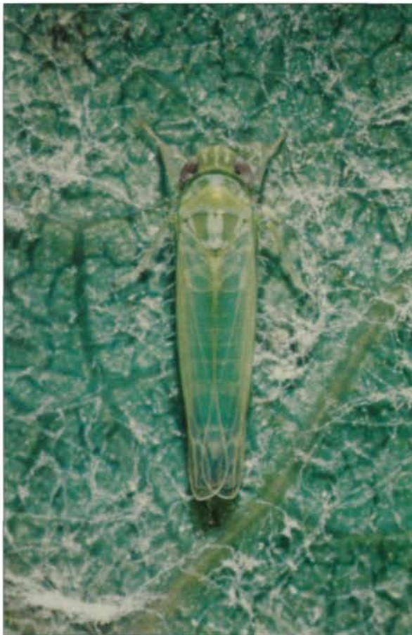
Fig. 3: Adult of Jacobiasca lybica (BERGEVIN & ZANON).