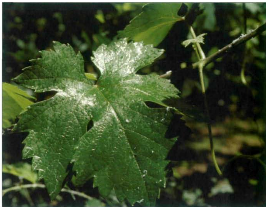
Fig. 6: Grapevine leaf with honeydew produced by Metcalfa pruinosa (SAY).

Acquisition. It is the starting phase during which the leafhoppers feed on infected plants, not necessarily grapevine, assuming the phytoplasma. Generally the acquisition happens in the young instars (nymphs of 3 rd -5 th instar) and takes from some hours to some days of time.