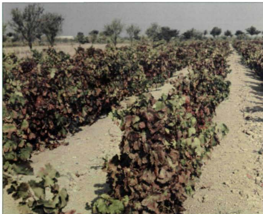
Fig. 4: Alterations caused by Jacobiasca lybica (BERGEVIN & ZANON).

The alterations caused by the feeding activity are very similar to those of E. vitis . The attack proceeds on grapevine in a proximo-distal way and carries on until autumn, or at least until there are feasible leaves on the plant. In the case of heavy infestations the leaf marginal necrosis may involve at the same time the whole foliage, that goes through the fall of the leaf blades, but not of the stalks (fig. 4).