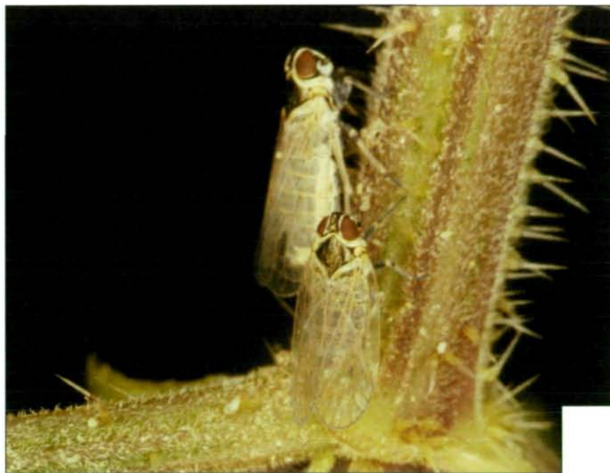
Fig. 7: Male and female of Hyalesthes obsoletus (SIGNORET).

H. obsoletus is the vector of the phytoplasma, agent of grapevine diseases known as „Vergilbungskrankheit“ in Germany and „Bois noir“ in France. The role of this species in the transmission of the phytoplasma is still to be