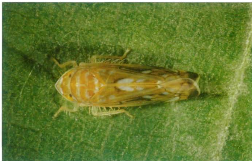
Fig. 9: Adult of Scaphoideus titanus BALL.

The 1 st instar nymph is 1.5-1.8 mm long. The head has a prominent vertex. The anten-