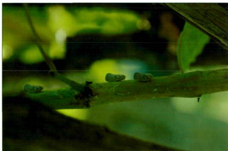
Fig. 5: Adults of Metcalfa pruinosa (SAY).

J. lybica has been considered a pest of vineyards in the Mediterranean basin, i.e. in Portugal, Spain, and in the two Italian islands, Sardinia and Sicily.