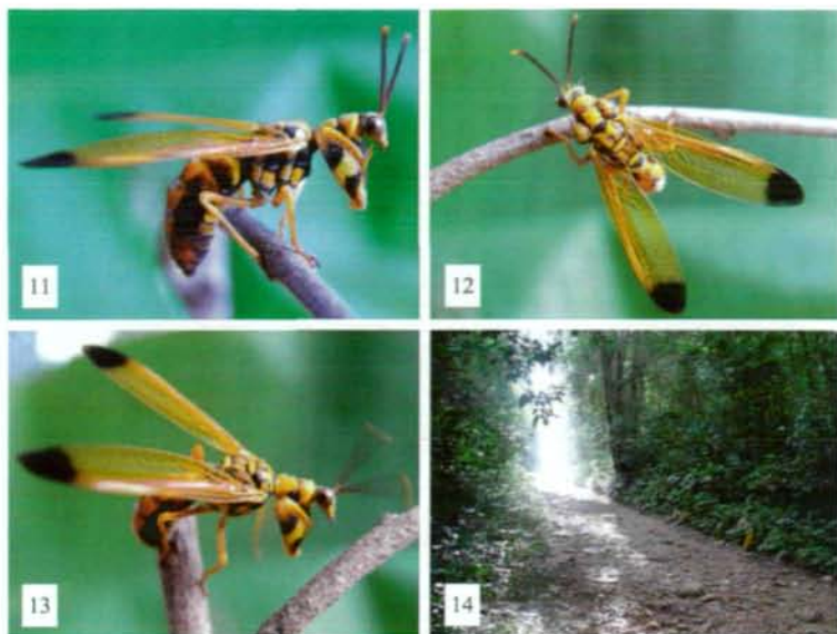
Fig. 11–14: Euclimacia horstaspoecki ; (11–13) holotype, photographs of the living specimen in Thailand; (14) type locality.

was usually moving around even when holding the prey or feeding on it. Based on the observations of E. horstaspoecki in Thailand and in captivity, it can be concluded that this species is an active, flying, diurnal (only?) hunter.