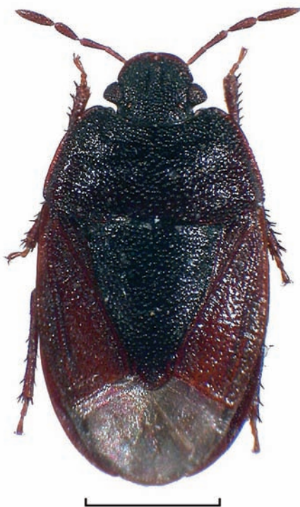
Fig. 1: Ochetostethus heissi nov.sp., male specimen from Cyprus (scale 1.0 mm).

leg. (coll. Linnavuori): 1♂ / Iran, Lowshan env. de Gilan, 01/06/1995, Linnavuori leg. (coll. Linnavuori): 1♂ / Turquie, massif du Karakus Dagi, sud de Capali, 08/07/1999, Matocq leg. (coll. Matocq): 1♂ / Salonica, Champion coll. B.M. 1927-109: 1♂.