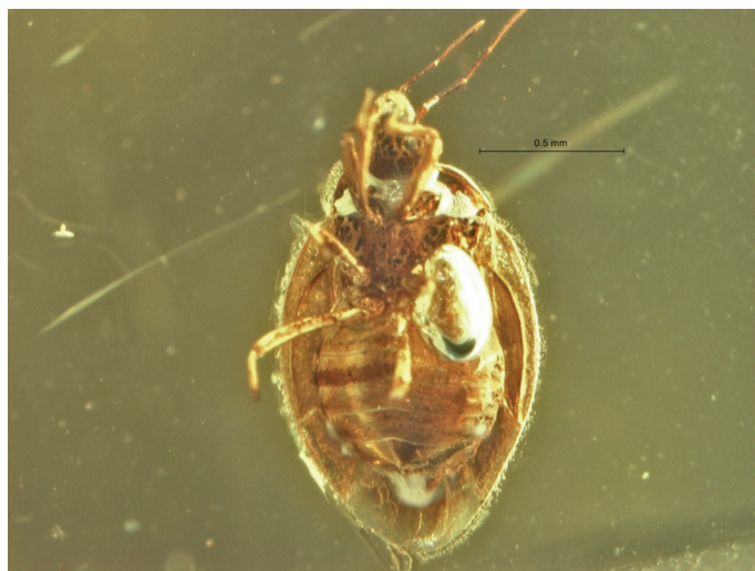
Fig. 1: Tytthophysa sylwiae nov.sp.; holotype, ♀, dorsal view (1).