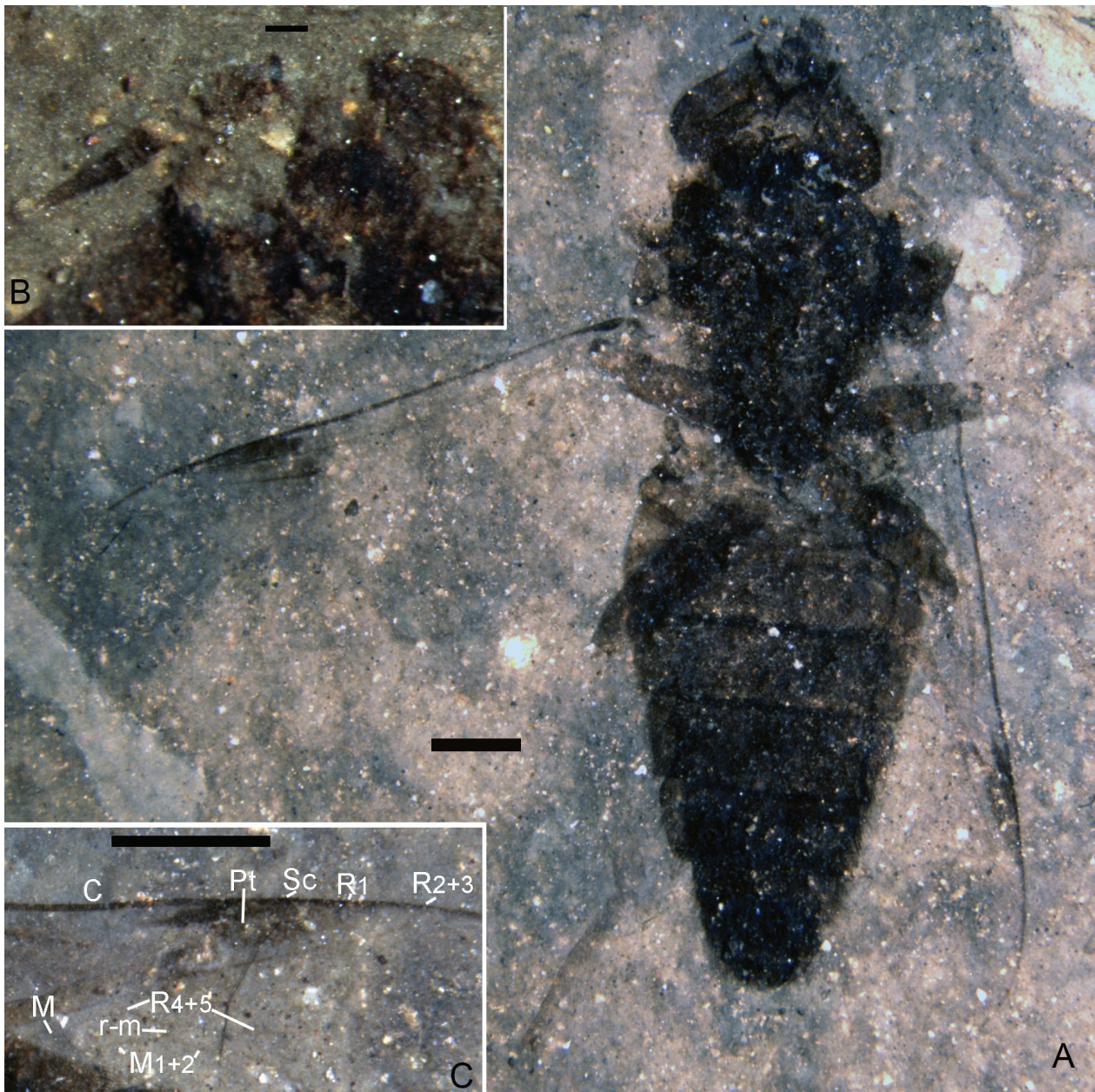
Figure 1. Sinonemestrius completus sp. n., no. NIGP L91803, holotype, photographs, male, dorsal view. A habitus, B antenna, C enlarged portions of right wing. Scale bars: 1 mm ( A , C ) and 0.1 mm ( B ).

to fork of M1+2; crossvein r-m meeting anterior margin of discal cell basad to its midlength; wing membrane with few markings (only limited to “Pt” and below it).