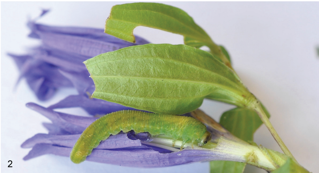
Figures 1, 2. Tenthredo atra larvae, nearly full-grown, on Gentiana asclepiadea (photographed respectively on 23.08.2019, 11.09.2019).