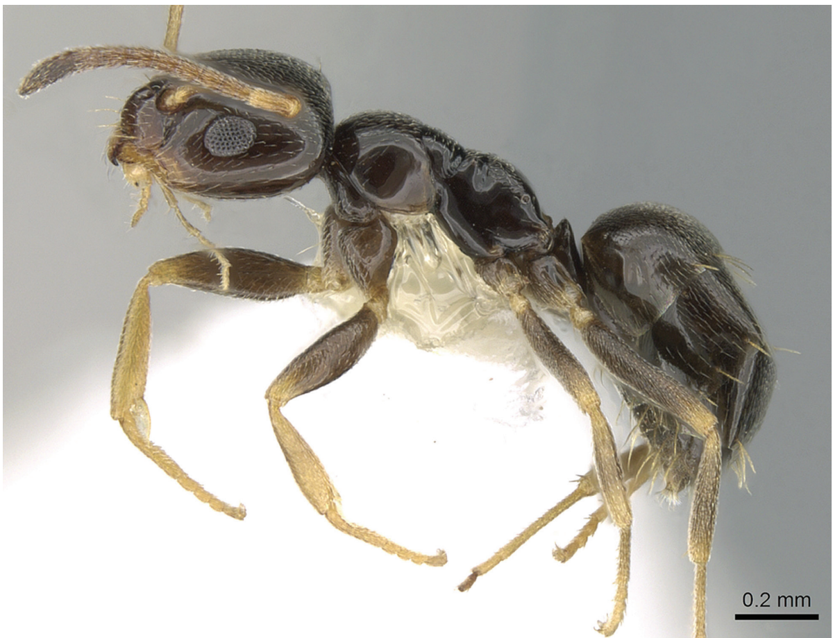
Figure 3. Lateral aspect of a worker of Plagiolepis schmitzii (image from AntWeb, 2020: CASENT0906252, photographer E. Ortega).