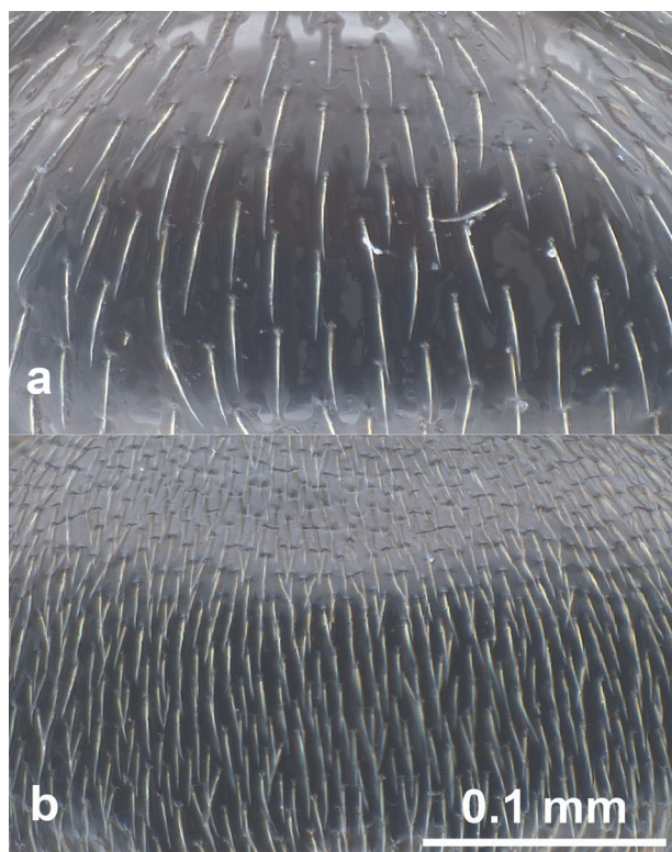
Figure 1. Surface of posterior part of 1 st gaster tergite of a worker of Plagiolepis taurica (a) and Pl. schmitzii (b).