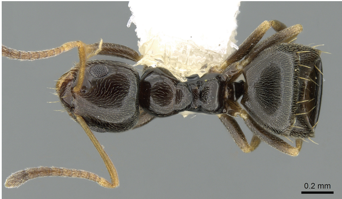
Figure 4. Dorsal aspect of a worker of Plagiolepis schmitzii.

of Pl. croisi , 0.994 in the type series of Pl. kabyla and 0.998 in the type series of Pl. perperamus . All five EDAs allocated any type series in agreement with the LDA wild-card runs. As a consequence, Pl. polygyna and Pl. tingitana are junior synonyms of Pl. schmitzii , whereas Pl. croisi , Pl. kabyla and Pl. perperamus are junior synonyms of Pl. atlantis . Without types of Plagiolepis barbara var. madeirensis Emery, 1921 being available, the synonymisation of this taxon with Pl. schmitzii is highly probable for two reasons: (1) the scape is very long: the data of SL and CW, as they can be derived with minimum distortions from the CASENT0905140 photo of the Pl. b. madeirensis type, are within the Pl. schmitzii cluster and outside the cluster formed by Pl. atlantis , Pl. invadens sp. nov. and Pl. barbara ; (2) Madeira seems to be inhabited by only a single, very abundant Plagiolepis species which is to be named Pl. schmitzii .