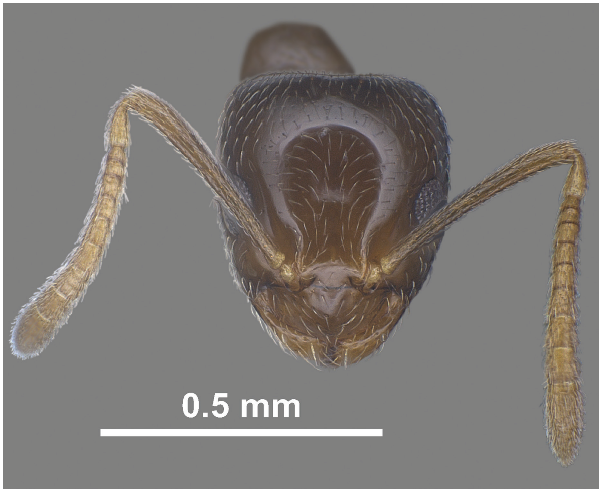
Figure 6. Head of the holotype worker of Plagiolepis invadens sp. nov.