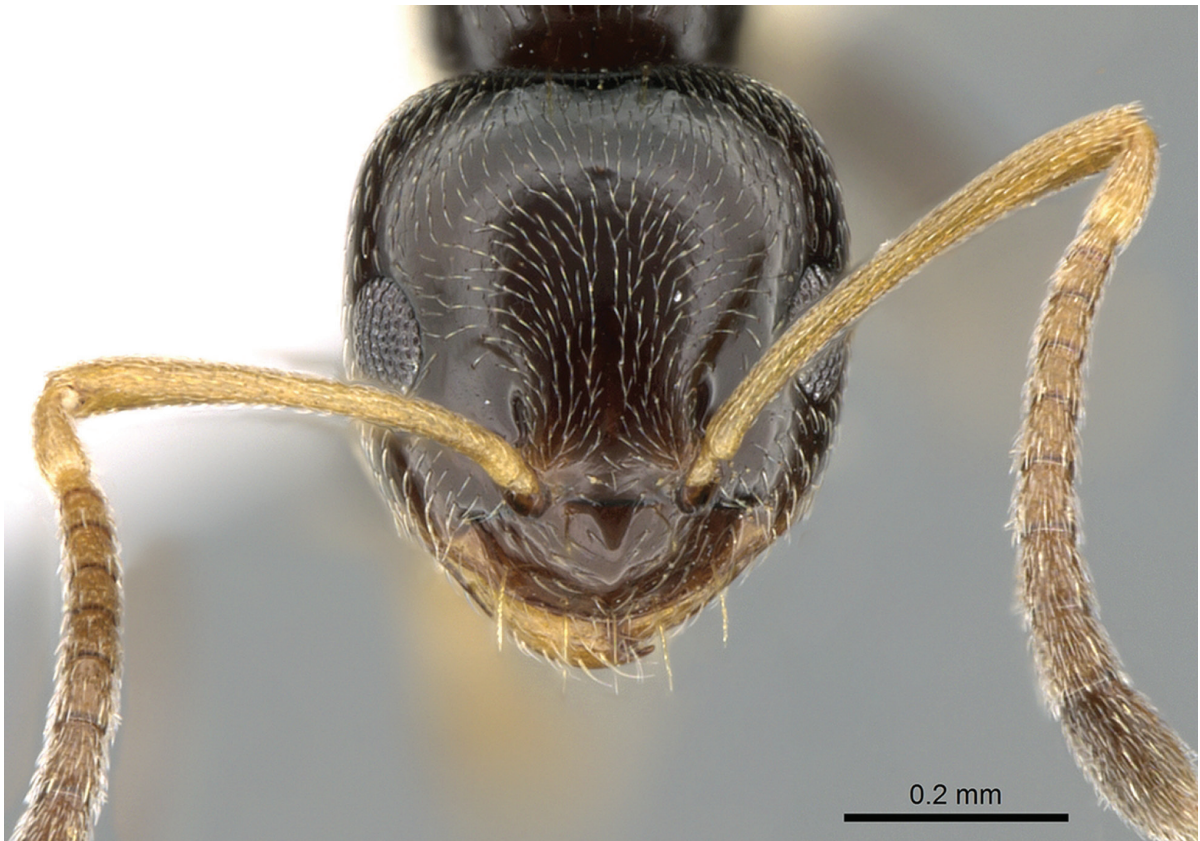
Figure 2. Head of a worker of Plagiolepis schmitzii (image from AntWeb, 2020: CASENT0906252, photographer E. Ortega).