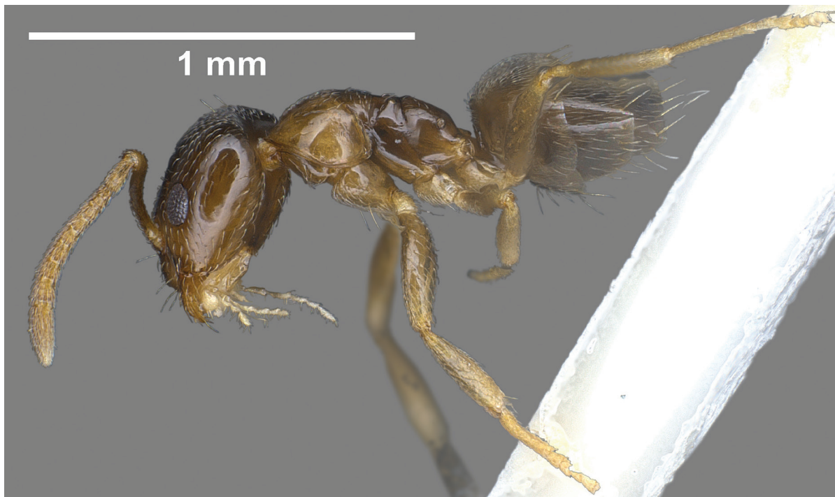
Figure 7. Lateral aspect of the holotype worker of Plagiolepis invadens sp. nov.