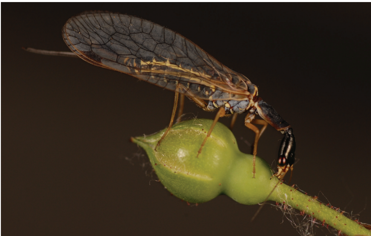
Figure 2. Ornatoraphidia flavilabris , female. Greece, Phokis, S Pendayi, 38°34.95'N, 22°03.45'E, 960 m, 31 May 2008, H. & U. Aspöck leg., now in coll. NHMW. (Photo: P. Sehnal, NHMW). Length of forewing: 10.5 mm.