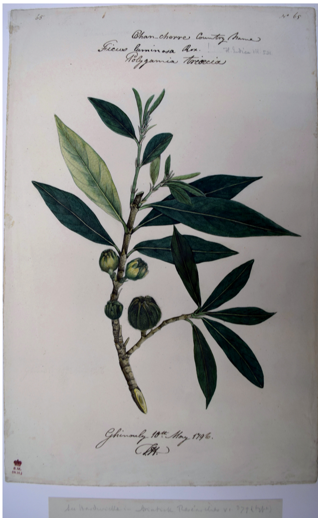
Fig. 5. Lectotype of Ficus laminosa Hardw., Hardwicke Drawing no. 65 from the collection of the Botany Library, Natural History Museum.