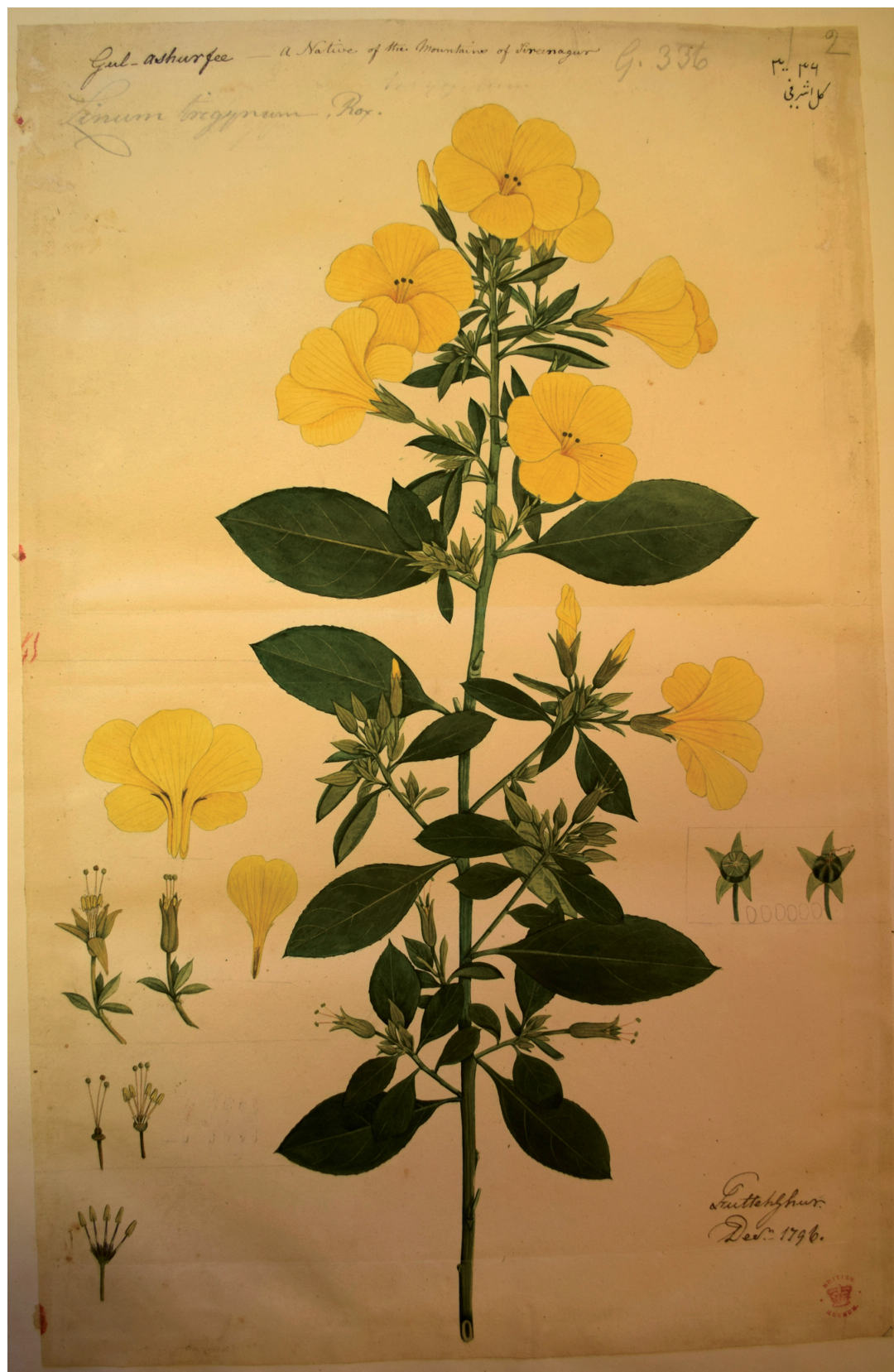
Fig. 4. Lectotype of Linum trigynum Roxb. ex Hardw., Hardwicke, Plants of India Vol. XVI (Add MS 11025): drawing no. 2.