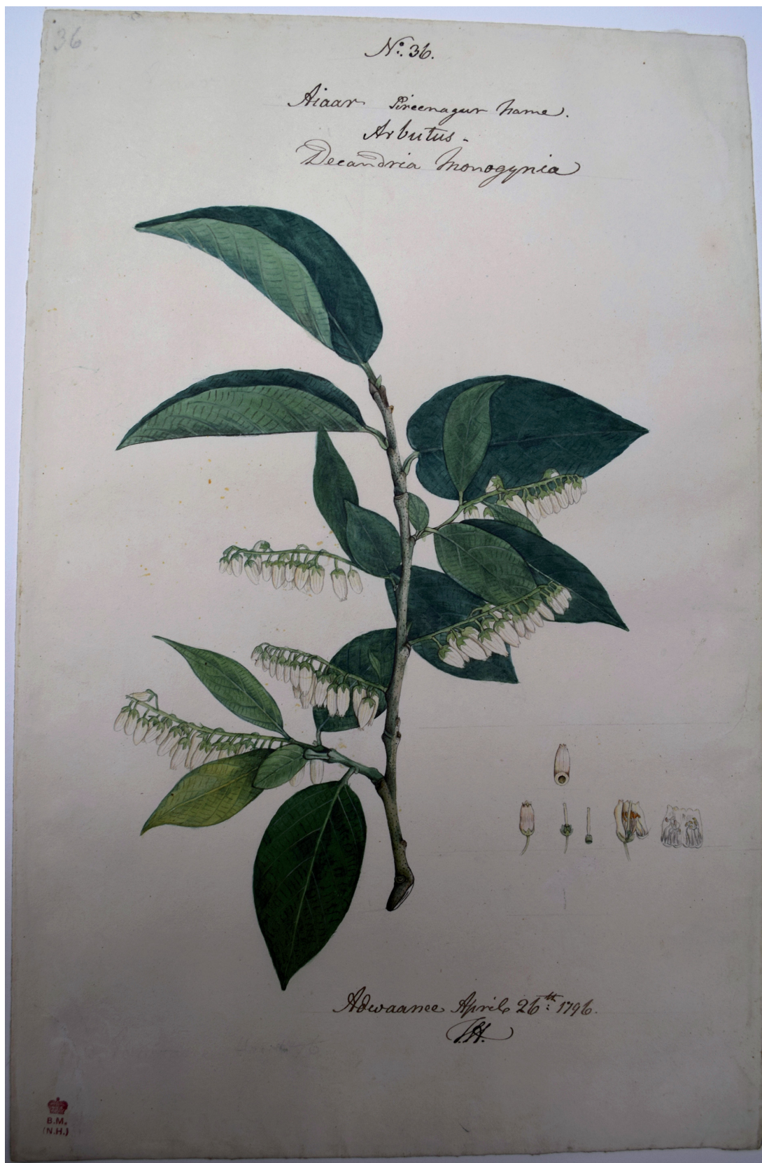
Fig. 8. Lectotype of Arbutus herpetica Coleb. ex Roxb., Hardwicke Drawing no. 36 from the collection of the Botany Library, Natural History Museum.