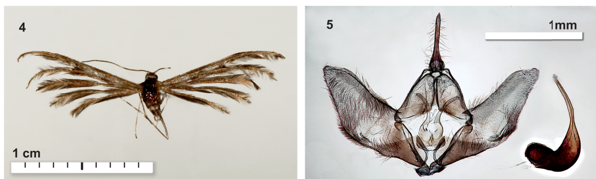
Figs 4–5. Singularia sinjaevi Kovtunovich & Ustjuzhanin sp. nov. 4. Holotype (ZISP 1838). 5. Holotype, genitalia (ZISP 1838).

The species is named after Viktor Synjaev, the prominent Russian traveller and entomologist, who collected this species.