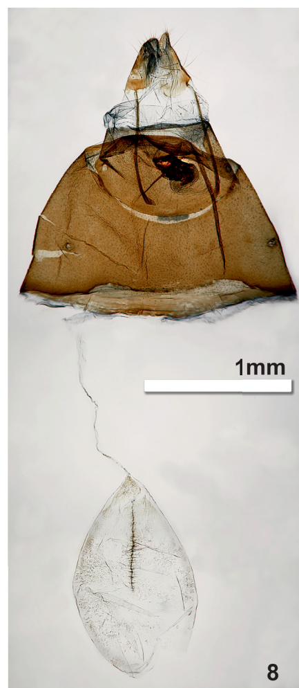
Figs 6–8. Singularia guajiro Kovtunovich & Ustjuzhanin sp. nov. 6. Holotype (ZISP 1842). 7. Holotype, genitalia (ZISP 1842). 8. Paratype, ♀, genitalia (ZISP 1843).