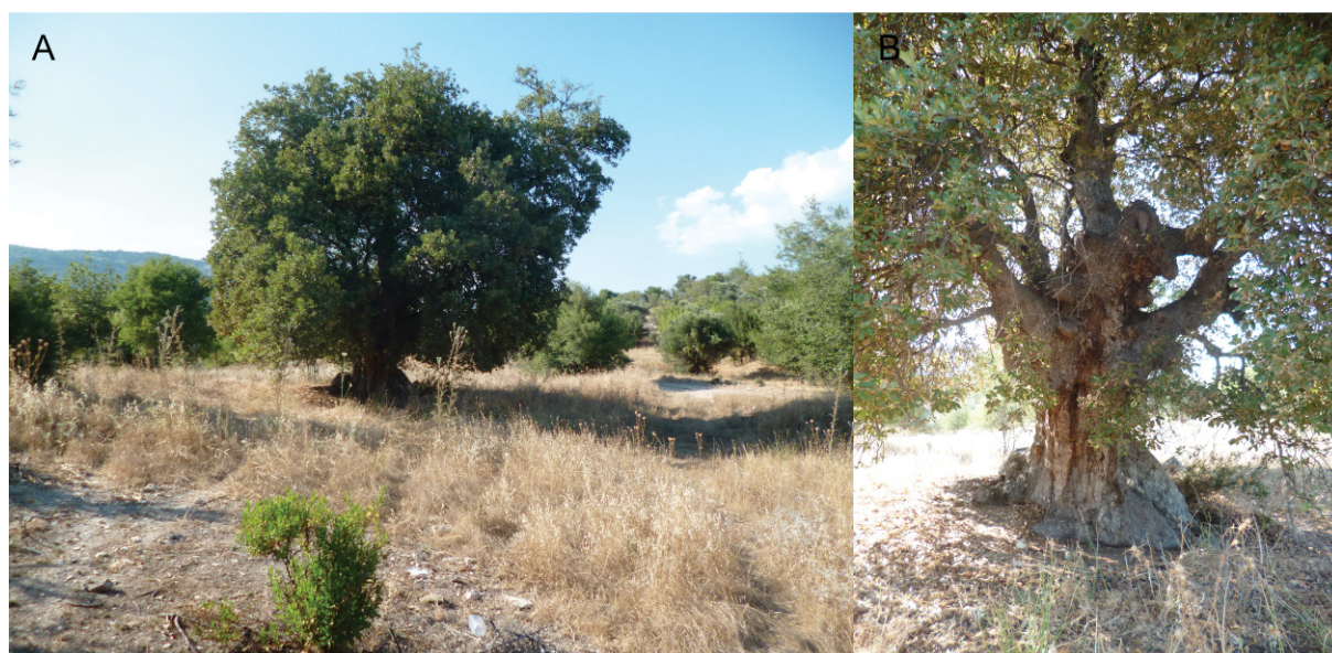
Fig. 4. A. Habitat of Brachypsectra sp. from Cyprus, Vretsia. B. Quercus infectoria Olivier.

We are not able to assign the Brachypsectra female and larva from Cyprus to any described species since only males are known in B. kadleci and B. jaechi sp. nov. The distribution of Brachypsectra species as well as the larger eyes in the female suggest its close relationship to B. jaechi sp. nov. from Turkey rather than to B. kadleci from Iran. The specimen from Cyprus differs from B. jaechi sp. nov. in having a lighter prosternum and mesoventrite, wider pronotal posterior angles with posterior carina very close to the lateral carina, and a shallower emarginate apex of the scutellum; however, we cannot exclude the possibility that this is only a result of sexual dimorphism. Until more material of both sexes and/or larvae for the Palearctic species is available for study, we retain the population from Cyprus as Brachypsectra sp.