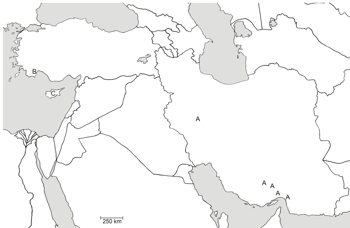
Fig. 3. Distribution of Brachypsectra in the Palearctic Region. A = B. kadleci Hájek, 2010; B = B. jaechi sp. nov.; C = Brachypsectra sp. from Cyprus.

There is intraspecific variability in populations of B. kadleci . Specimens from the type locality (Lorestan, western Iran; Fig. 3) are distinctly bicolored with darker elytra (Fig. 1A–B) and have the median lobe of the aedeagus almost sub-parallel, more distinctly attenuating subapically (Fig. 2D). Specimens collected in southern Iran (Fig. 3) are almost uniformly yellowish-testaceous to testaceous (Fig. 1C–D), with the median lobe of the aedeagus more gradually narrowed towards the apex (Fig. 2E). Taking into consideration the gradation in elytral coloration (from yellowish-testaceous through testaceous and reddish-brown to dark brown; Fig. 1A–D), slight differences in the shape of the median lobe and the rarity of the specimens available for study, we refrain here from making any taxonomic conclusions and consider all specimens from Iran conspecific. Brachypsectra fulva from North America and Brachypsectra