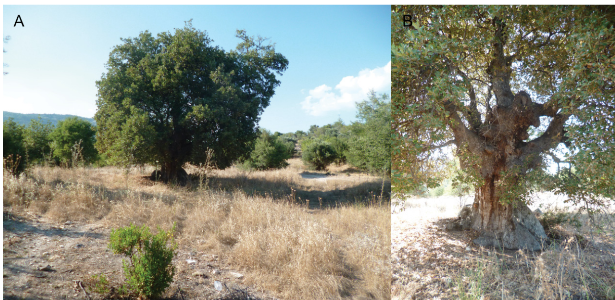
Fig. 4. A. Habitat of Brachypsectra sp. from Cyprus, Vretsia. B. Quercus infectoria Olivier.

We are not able to assign the Brachypsectra female and larva from Cyprus to any described species since only males are known in B. kadleci and B. jaechi sp. nov. The distribution of Brachypsectra species as well as the larger eyes in the female suggest its close relationship to B. jaechi sp. nov. from Turkey rather than to B. kadleci from Iran. The specimen from Cyprus differs from B. jaechi sp. nov. in having a lighter prosternum and mesoventrite, wider pronotal posterior angles with posterior carina very close to the lateral carina, and a shallower emarginate apex of the scutellum; however, we cannot exclude the possibility that this is only a result of sexual dimorphism. Until more material of both sexes and/or larvae for the Palaearctic species is available for study, we retain the population from Cyprus as Brachypsectra sp.