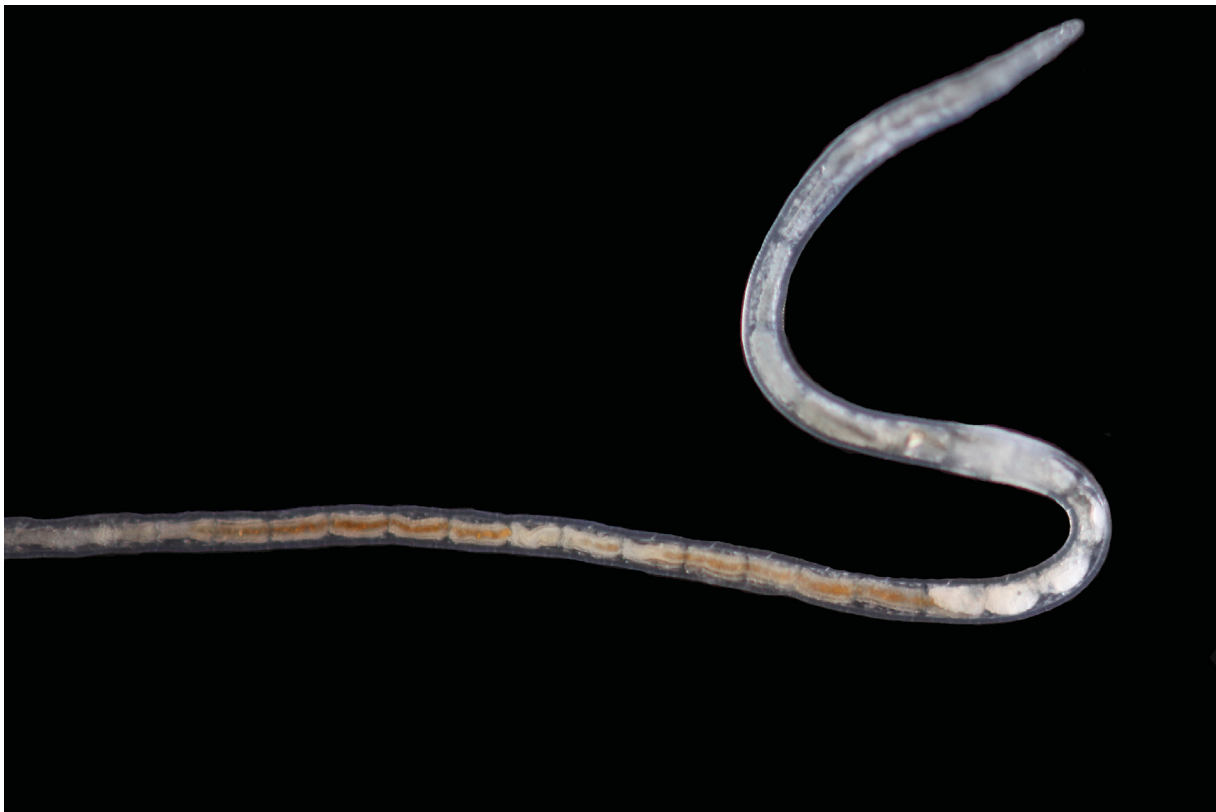
Fig. 1. Specimen of Grania chilensis Prantoni, De Wit & Erséus, 2016.

The checklist is arranged in chronological order and based on a bibliographic survey. All records of Grania from published papers and monographs were reviewed. When available, additional information on habitat, geographical distribution and museum catalogue numbers is included.