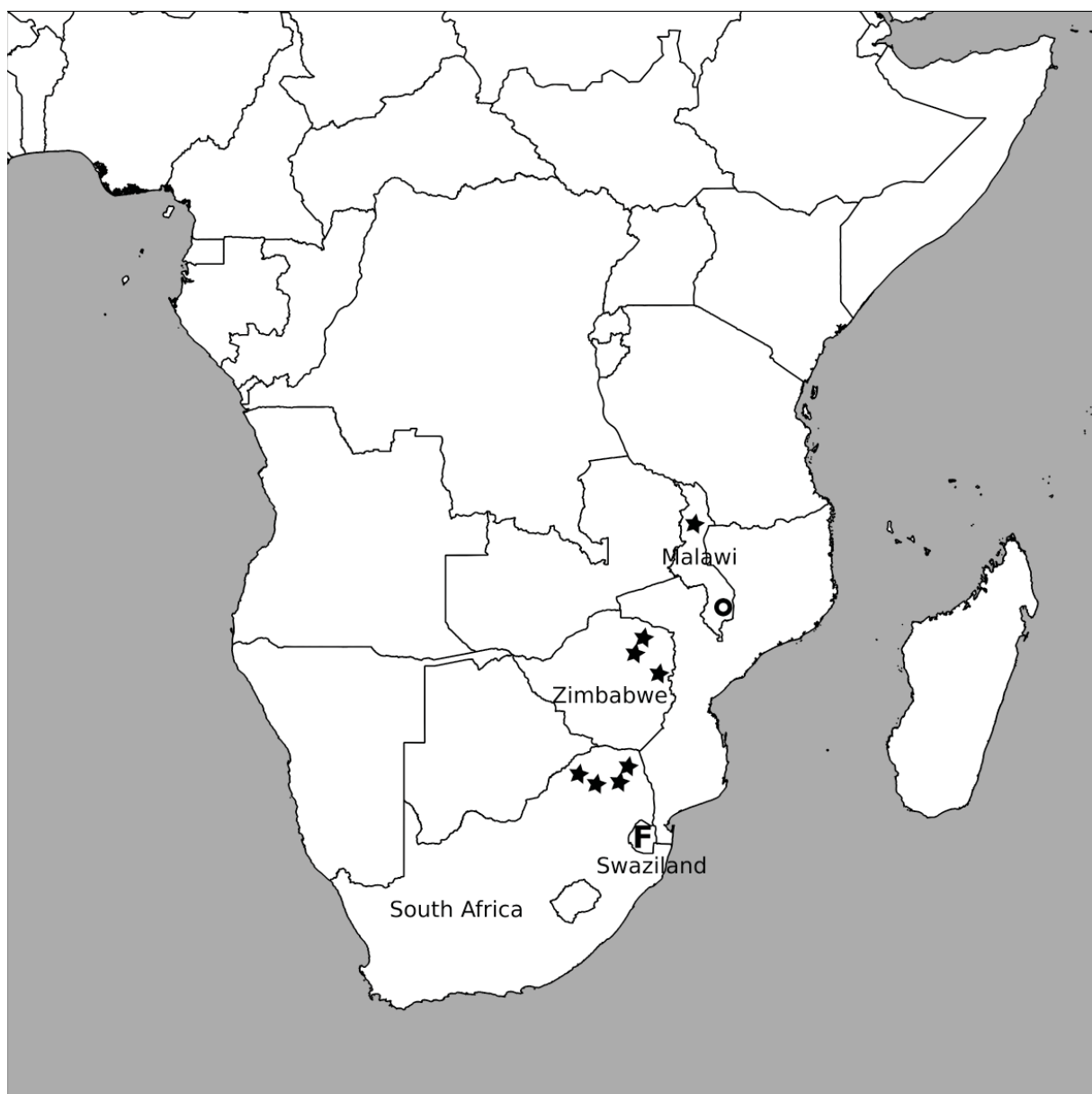
Fig. 4. Collection localities of males of Dorsomitius neavei (Kimmins, 1949) gen. et comb. nov. (circle), D. tjederi sp. nov. (stars) and Dorsomitius sp. ♀ in Swaziland (F).

belongs to an unidentified genus. This latter specimen, with tip of abdomen missing (possibly dissected by van der Weele), was designated by van der Weele as the male of the female S. buyssoni . Concerning this last specimen, it should be noted that the third abdominal sternite harbors a marking very similar to the one of Dorsomitius gen. nov. and its relative length is also the same as in male Dorsomitius gen. nov. However, if the sex determination made by van der Weele is correct, we consider that the shape of the first abdominal tergite, which is weakly sclerotized and divided along the dorsal midline into a pair of dorso-lateral plates and not developed dorsally into a forked projection, clearly differentiates it from Dorsomitius gen. nov. Examination of this specimen shows that the color pattern of the third abdominal sternite in Dorsomitius gen. nov. is very probably shared with another genus. In the case of females, the separation of both genera is currently not possible and necessitates the examination of additional material.