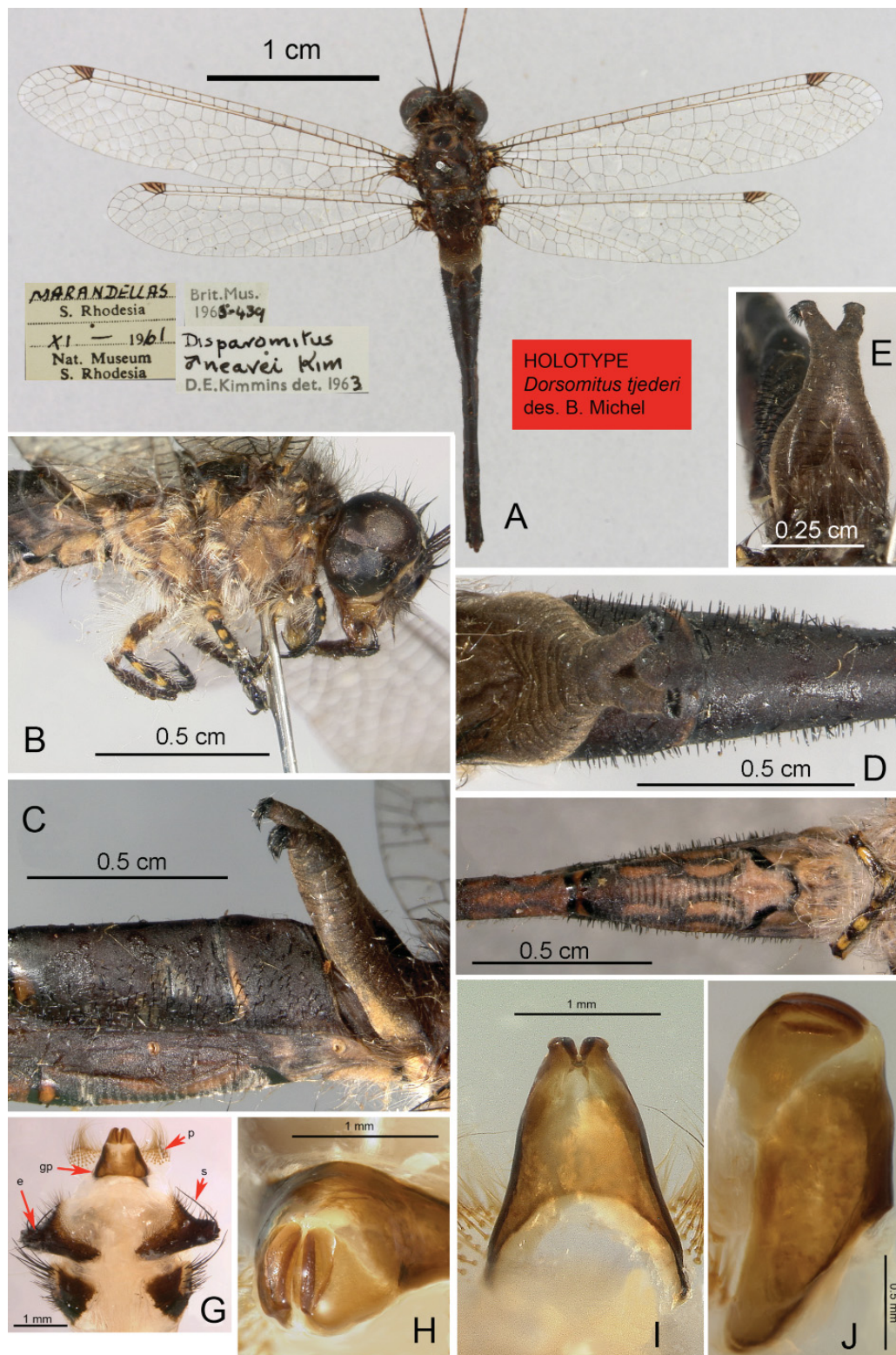
Fig. 2. Dorsomitrus tjederi gen. et sp. nov., holotype, ♂ (NHMUK 1963-439). A. Habitus with associated labels. B. Lateral view of head and thorax. C. First to third abdominal tergites, right lateral view. D. Same as previous, dorsal view. E. First abdominal tergite, front view. F. Base of abdomen, ventral view. G. Terminalia and genitalia, dorsal view. H. Gonarcus-parameres complex, caudal view. I. Same as previous, dorsal view. J. Same as previous, left lateral view.