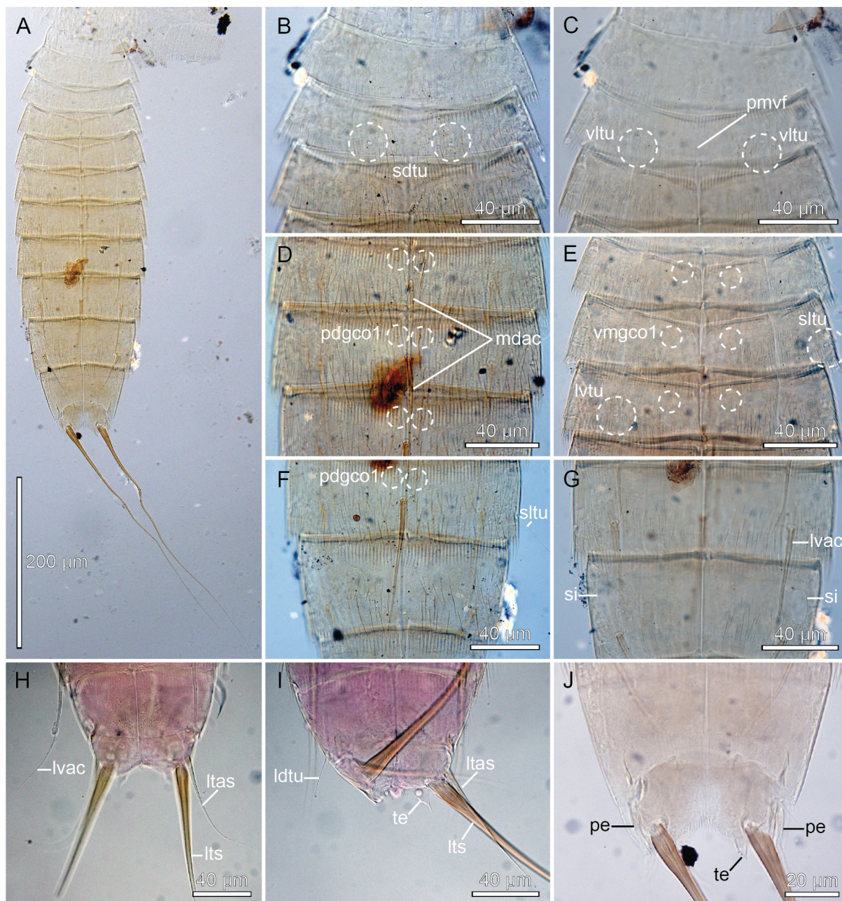
Fig. 3. Light electron micrographs of Echinoderes levanderi Karling, 1954. A–G, J. Neotype, ♂ (SMNH 157575). H. ♀ (SMNH 157577d). I. ♀ (SMNH 157577a). A. Ventral overview. B. Segments 1–3, dorsal view. C. Segments 1–3, ventral view. D. Segments 6–8, dorsal view. E. Segments 3–5, ventral view. F. Segments 8–9, dorsal view. G. Segments 8–9, ventral view. H–I. Segments 10–11, ventral view. J. Segment 10–11, ventral view. Abbreviations: ldtu, laterodorsal tube; ltas, lateral terminal accessory spine; lts, lateral terminal spine; lvac, lateroventral acicular spine; lvtu, lateroventral tube; mdac, middorsal acicular spine; pdgco1, paradorsal glandular cell outlet type 1; pe, penile spines; pmvf, partial midventral fissure; sdtu, subdorsal tube; sltu, sublateral tube; si, sieve plate; te, tergal extension; vltu, ventrolateral tube; vmgco1, ventromedial glandular cell outlet type 1.