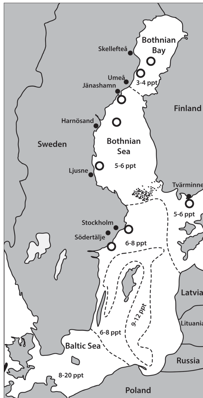
Fig. 1. Map of the Baltic Sea and Gulf of Bothnia, with collecting localities indicated as black rings. Approximate bottom water salinity gradients are indicated with dashed lines (source: Axe & Sahlsten 2001).

(1928), but since then, there have been extremely few reports. Zelinka (1928) reported no less than three pycnophyid species from the Baltic Sea: Pycnophyes giganteus (Zelinka, 1928), Setaphyes dentatus (Reinhard, 1881), and Setaphyes kielensis (Zelinka, 1928), all from the Kiel Bight. A few years later, Lang (1936) reported Setaphyes flaveolatus (Zelinka, 1928) from Oresund, which connects the Baltic Sea with the more open waters in Kattegat. Higgins (1983) erroneously cited Lang (1936) for also reporting Pycnophyes calmani Southern, 1914 from Oresund, but this record was actually from Gilleleje in Kattegat. Reimer (1963) reported two additional pycnophyid species for the first time from the Baltic Sea, Pycnophyes communis Zelinka, 1928 and Krakenella maxima (Reimer, 1963), both from Kadetrinne