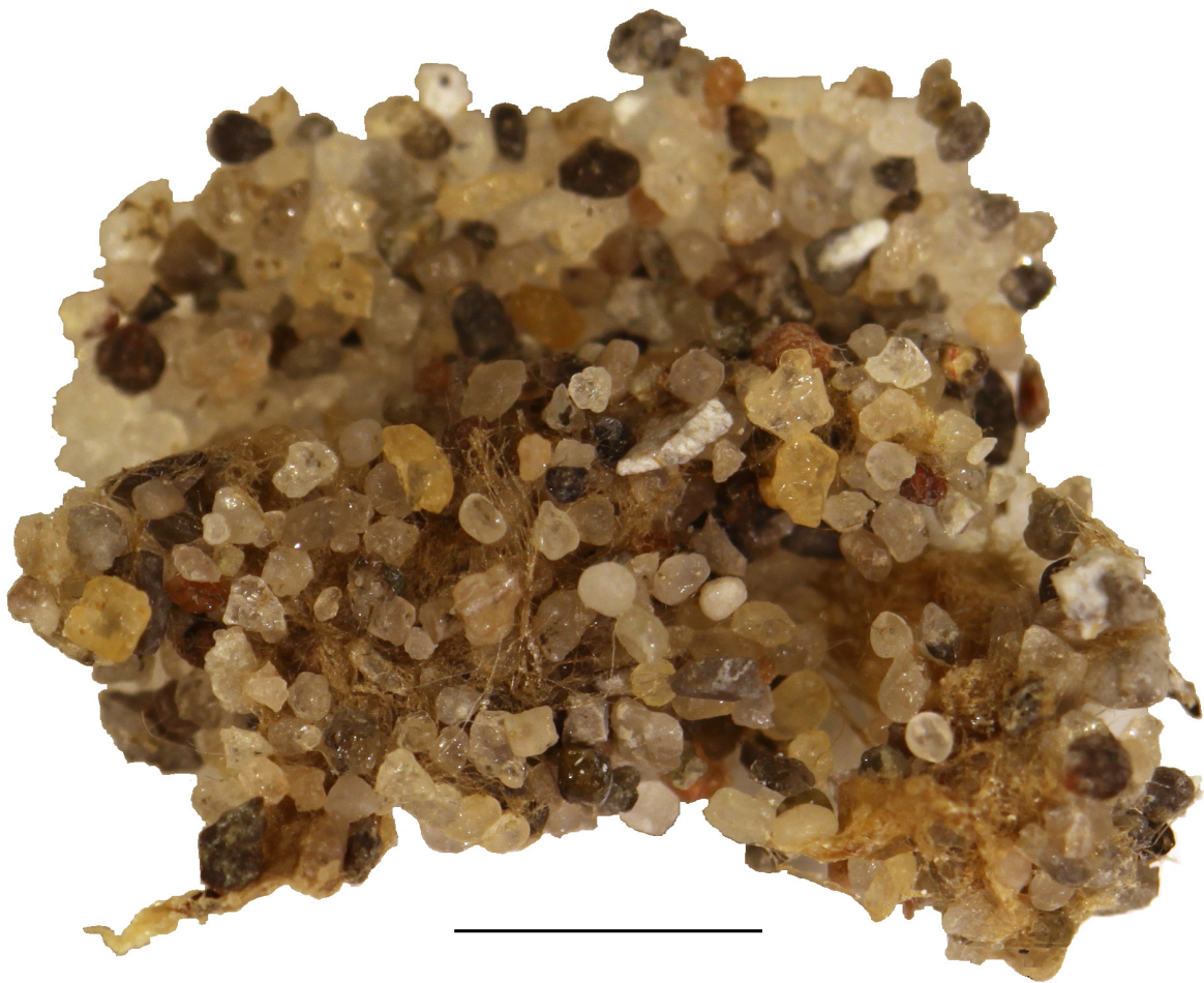
Fig. 2. Modiolus cimbricus sp. nov. A 17.5 mm long specimen in its ball of sand grains. This specimen has been cultured for five years. Scale bar = 5 mm.

A plausible hypothesis is that Modiolus cimbricus sp. nov. has evolved into a separate species after the Weichselian glaciation. It closely resembles M. adriaticus , from which it has evolved. The latter species belongs to the Lusitanian (Mediterranean) fauna that today has its northern border on the south and west coasts of the British Isles, including the Irish Sea (Ekman 1953; Hylleberg & Riis-Vestergaard 1984) (Fig. 3). This fauna is characterized by its corresponding Mediterranean-influenced water masses from the south. Today, a branch of the Gulf Stream presses towards the northwestern parts of the British Isles and the North Sea. It fills the latter with its water and results in a very stable current pattern because it is determined by sufficient water depth that allows for three amphidromic points in the North Sea (Dietrich 1963; Jelgersma 1979; Lund-Hansen et al. 1994; see also below). Consequently, the edge