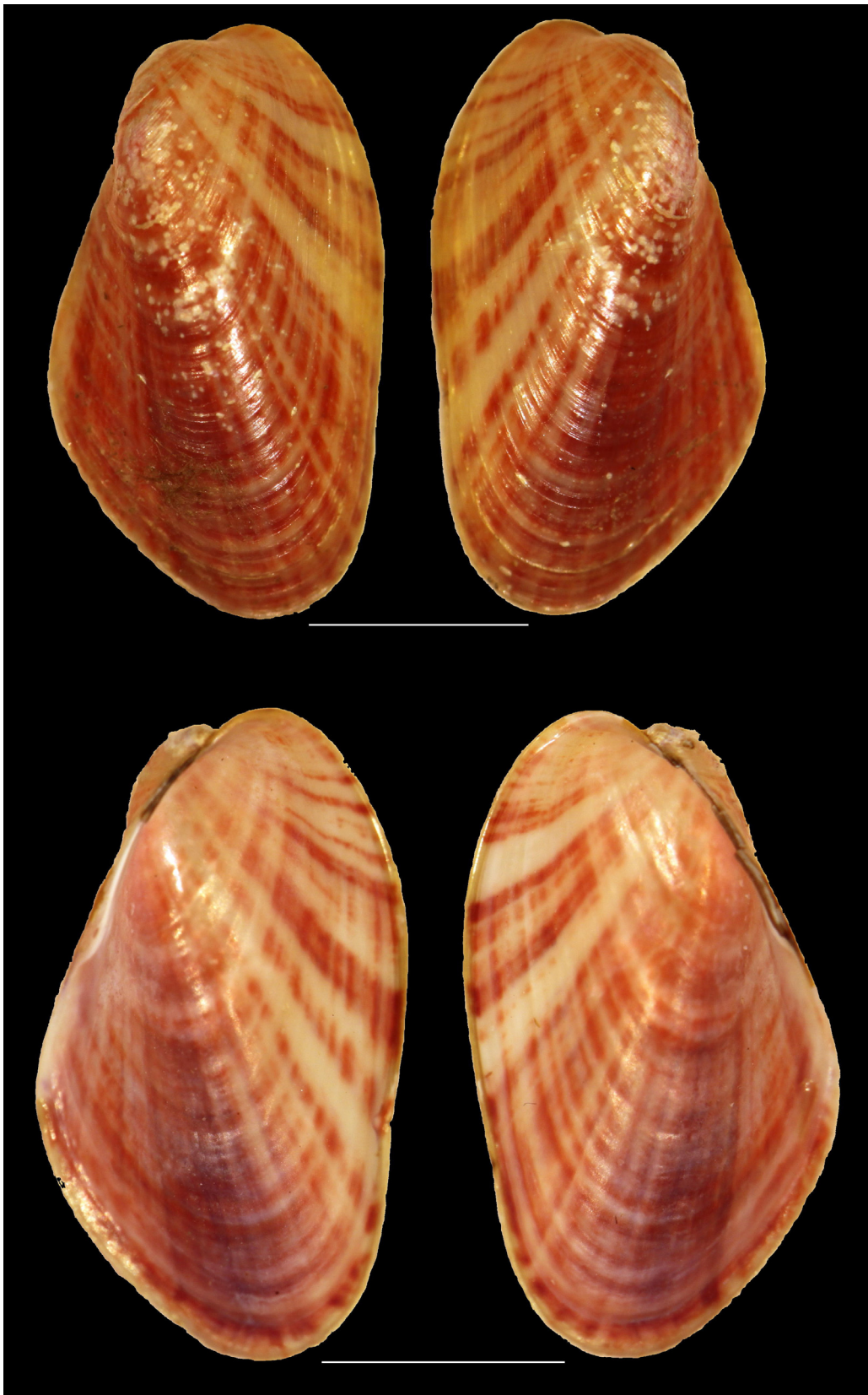
Fig. 1. Modiolus cimbricus sp. nov., holotype (shell length 13.3 mm). The upper part of the figure shows the external shell side and the lower part shows the inner side of the valves. Scale bars = 5 mm.