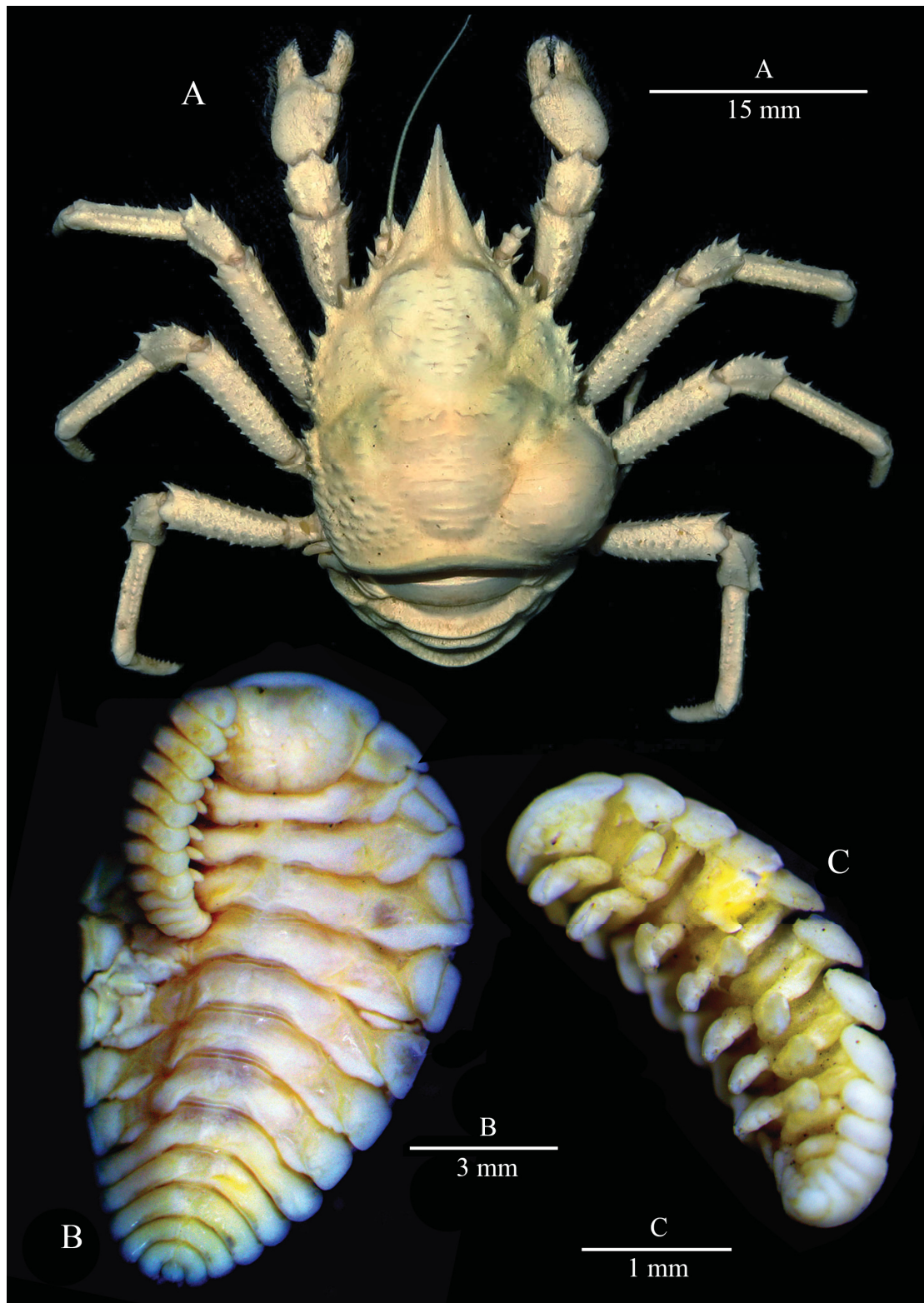
Fig. 1. Micrographs of Pleurocryptella altalis sp. nov. and host Munidopsis petalorhyncha Baba, 2005 (ZMMU Ma 3504). A. Munidopsis petalorhyncha , ♂, with swelled right branchial chamber from Pleurocryptella altalis sp. nov. B. Pleurocryptella altalis sp. nov., holotype, ♀, dorsal view (ZMMU Mc 1420) with attached allotype, ♂ (ZMMU Mc 1421). C. Pleurocryptella altalis sp. nov., allotype, ♂, oblique ventral view (ZMMU Mc 1421).