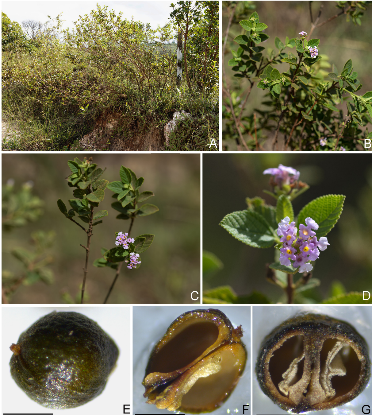
Fig. 1. Lippia raoniana P.H.Cardoso & Salimena sp. nov. A. Habit. B–C. Branch with inflorescence. D. Inflorescence frontal view. E–G. Drupaceous fruit. E. Overview. F. Longitudinal section showing two pyrenes. G. Cross section showing two pyrenes and seeds. Scale bars: E–G = 1 mm.

surface matte, sparsely strigose, densely covered by sessile glandular trichomes, abaxial surface densely covered by sessile glandular trichomes, strigose along the veins. Inflorescence one per axil, 0.5–1 cm long, capituliform, hemispherical, rachis not elongated in the infructescence, peduncle 0.8–1.3 cm long, cylindrical, slender, strigose, with abundant sessile glandular trichomes; bracts 3–5 mm long, green, spirally arranged, ovate, apex acute to obtuse, margin ciliate, adaxial surface strigose, covered by sessile