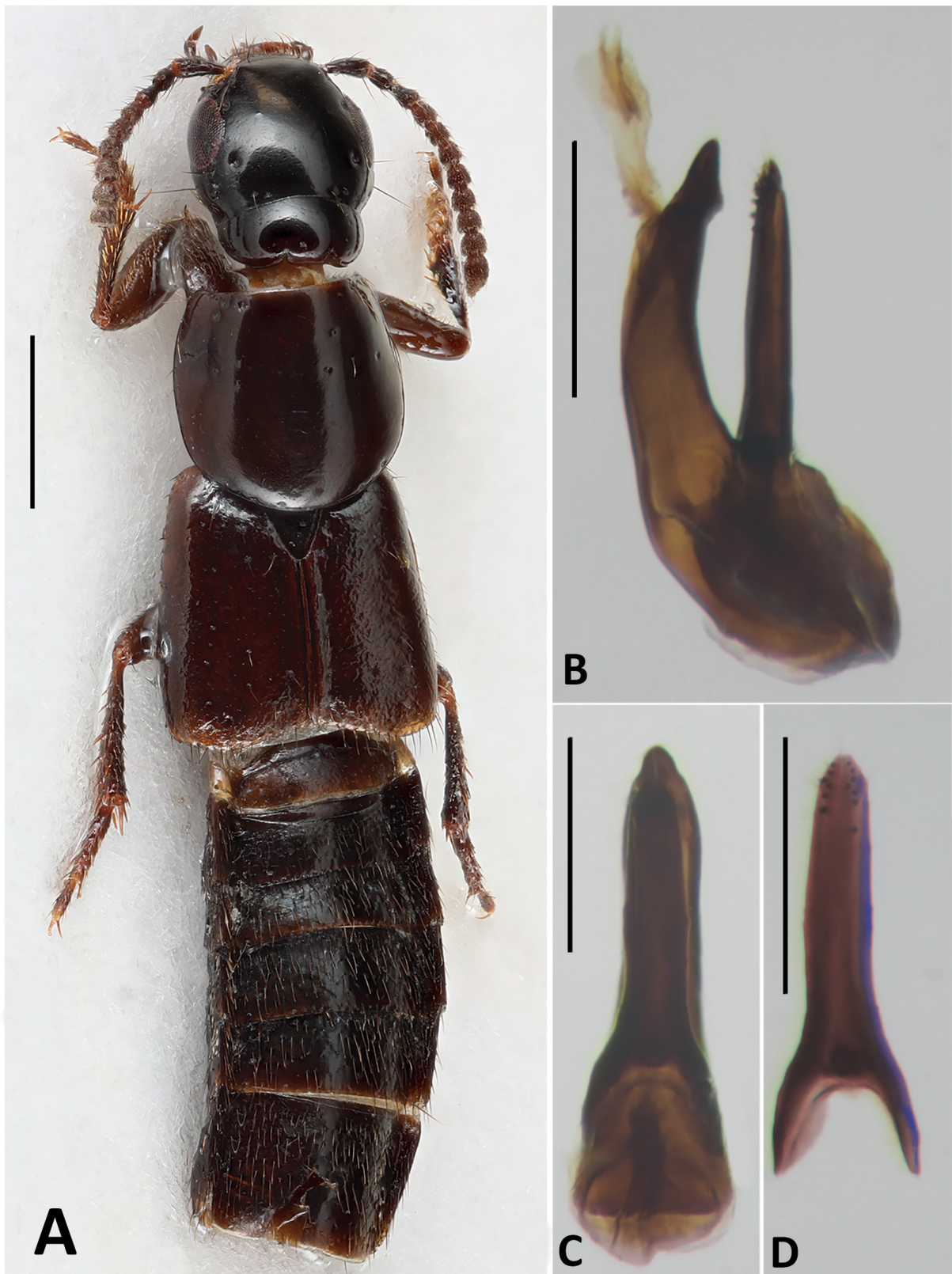
Fig. 4. Quedius sp. aff. gissaricus (ZIN). A. Habitus. B–D. Aedeagus. B. Lateral view. C. From parameral side. D. Paramere (underside). Scale bars: A = 1 mm; B–D = 0.5 mm.