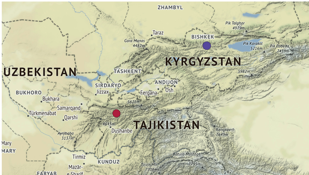
Fig. 2. Distribution map showing the type localities of Quedius gissaricus sp. nov. (red circle) and Q. viator sp. nov. (violet circle).

MEASUREMENTS AND RATIOS. HL: 1.25; HW: 1.39; PL: 1.5; PW: 1.68; EL: 2.02; EW: 1.93; FB: 4.75; TL: 8.84; HL/HW: 0.90; PL/PW: 0.88; EL/EW: 1.05; PL/EL: 0.73; PW/EW: 0.87.