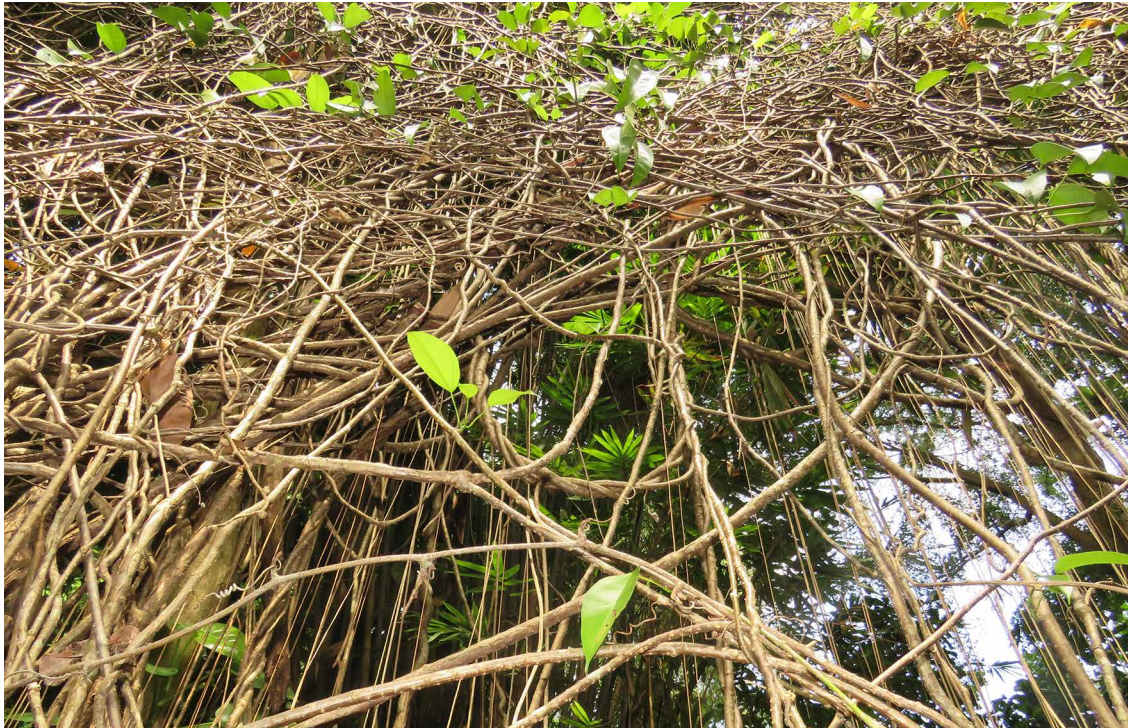
Fig. 6. Plant of Tinospora singapura I.M.Turner sp. nov. in Singapore showing stems and abundant aerial roots.