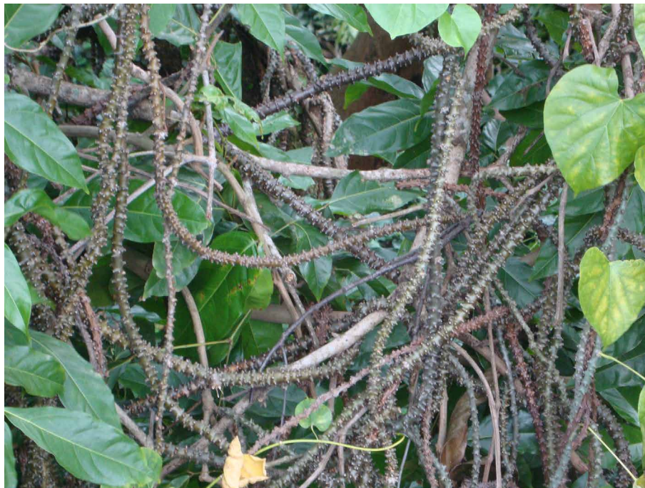
Fig. 1. Tinospora crispa (L.) Hook.f. & Thomson growing in Singapore showing the densely tuberculate stems.

Large woody climber with many pale, smooth, descending adventitious roots. Stem glabrous, succulent, tuberculate, each tubercle conical, topped by a pale lenticel with an outer woody ring, often radially cracked, and a central woody plug, bark thin, drying dark coppery brown, surface smooth and shiny, younger stems drying brown or grey, irregularly longitudinally wrinkled, wrinkles sharp-edged; cut stems producing a milky sap, very bitter to the taste. Leaves membranous to chartaceous, glabrous, not peltate, basally 5-nerved with small hollow domatia in axils of nerve bases, main nerves slightly raised