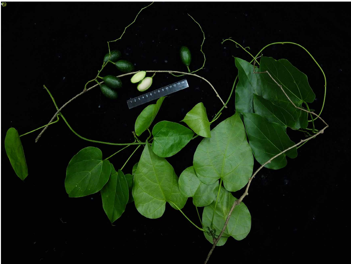
Fig. 4. Specimen of Tinospora macrocarpa Diels from Singapore with unripe fruits.

Large woody climber with twining young shoots; descending aerial roots present. Old stems drying red-brown, irregularly longitudinally wrinkled, bark thin, smooth, shiny with scattered pale raised lenticels,