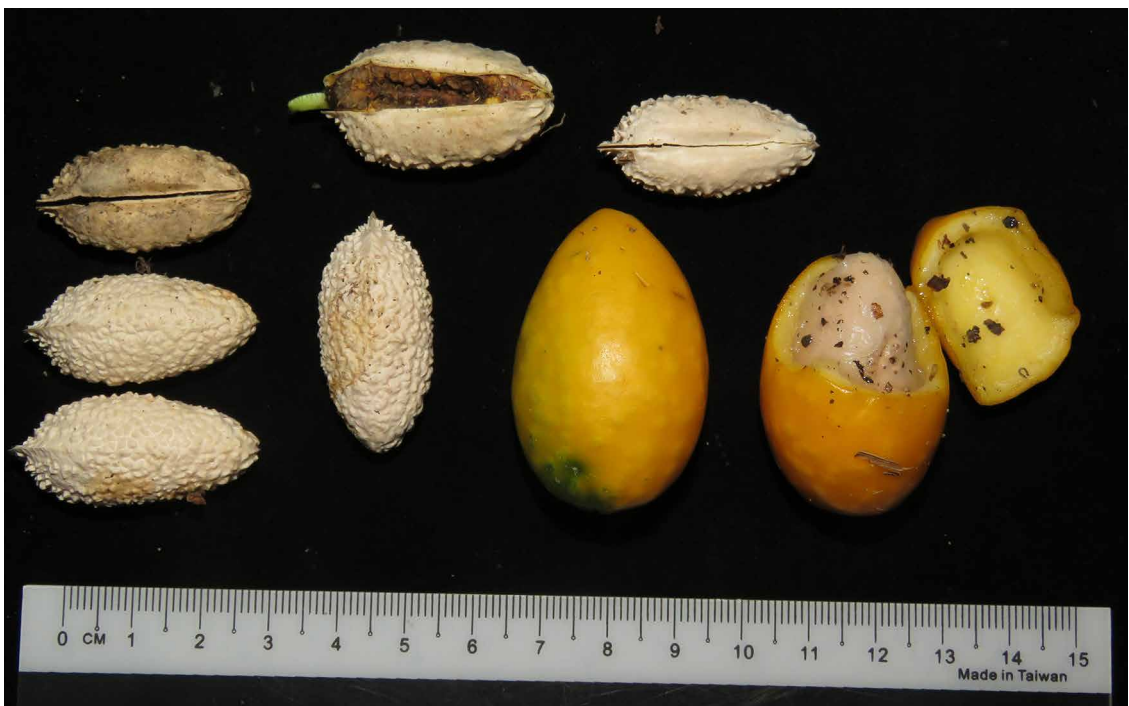
Fig. 7. Fallen fruits and endocarps of Tinospora singapura I.M.Turner sp. nov., with the seed germinating in one case.