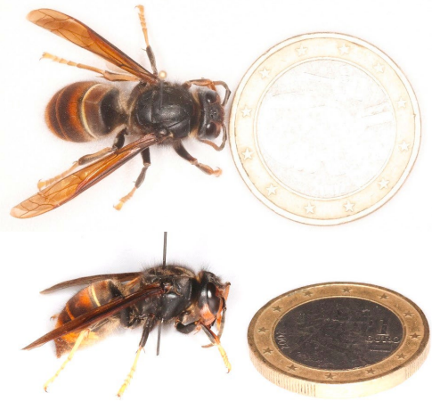
Fig. 2: Vespa velutina specimen after species identification and prior to dissection (1 Euro coin as reference; diameter = 23.25 mm).