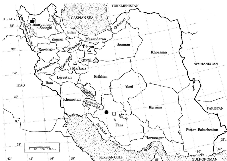
Fig. 3: Map of Iran with geographical distribution of studied materials. Eupelmus miellneri \Delta ; Eusandalum inerme \bullet ; Calocleonymus pulcher \blacksquare ; Chalcedectus balachowskyi \square ; Cheiropachys quadrum \circ .