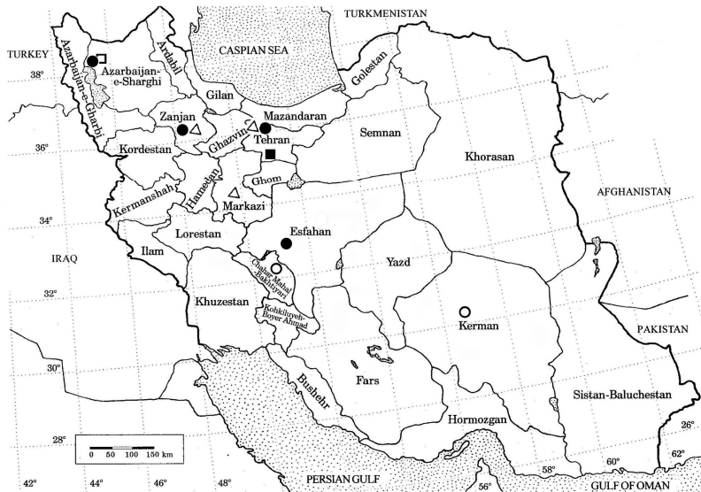
Fig. 2: Map of Iran with geographical distribution of studied materials. Entedon ergias Δ; Eurytoma morio ●; Eurytoma arctica ■; Eurytoma blastophagi □; Eurytoma iranica ○.