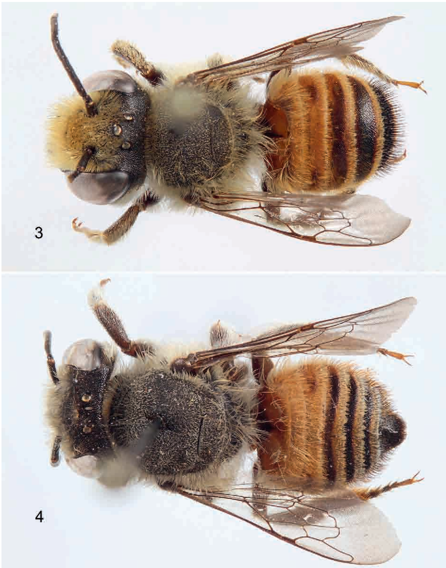
Figs 3-4: Photomicrographs of Megachile (Eutricharaea) ventrisi ENGEL 2008, dorsal habitus. (3) male; (4) female.