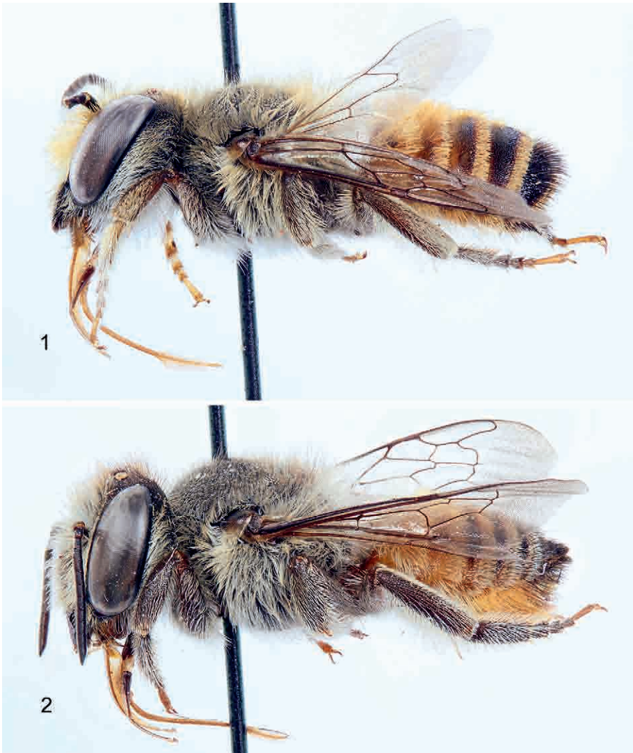
Figs 1-2: Photomicrographs of Megachile (Eutricharaea) ventrisi ENGEL 2008, lateral habitus. (1) male; (2) female.