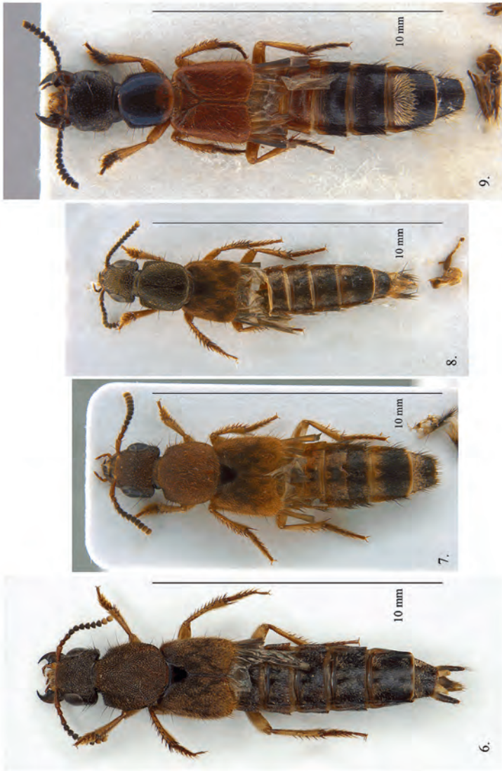
Figs 6-9: (6) P. hewitti Bnh., male from Danum valley (7) P. rufulus n. sp. Holotype (8) P. oblongopunctatus n. sp., Paratype from Danum valley (9) P. donnyi n. sp., Holotype. Scale bars = 10 mm.