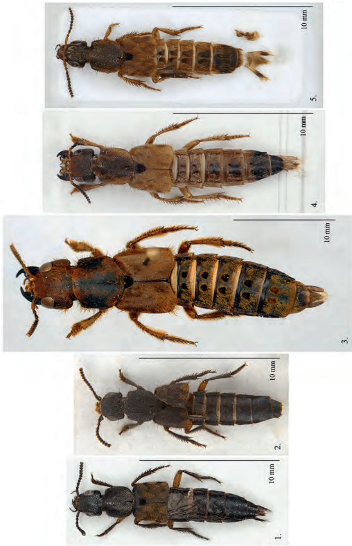
Figs 1-5: (1) P. aenaepennis Cam., ex. from Danum valley (2) P. sladeae n. sp., Holotype (3) P. borneensis n. sp., Paratype from Danum valley (4) P. villanuevai n. sp., Holotype (5) P. aeneocreus Cam., male from Danum valley. Scale bars = 10 mm.