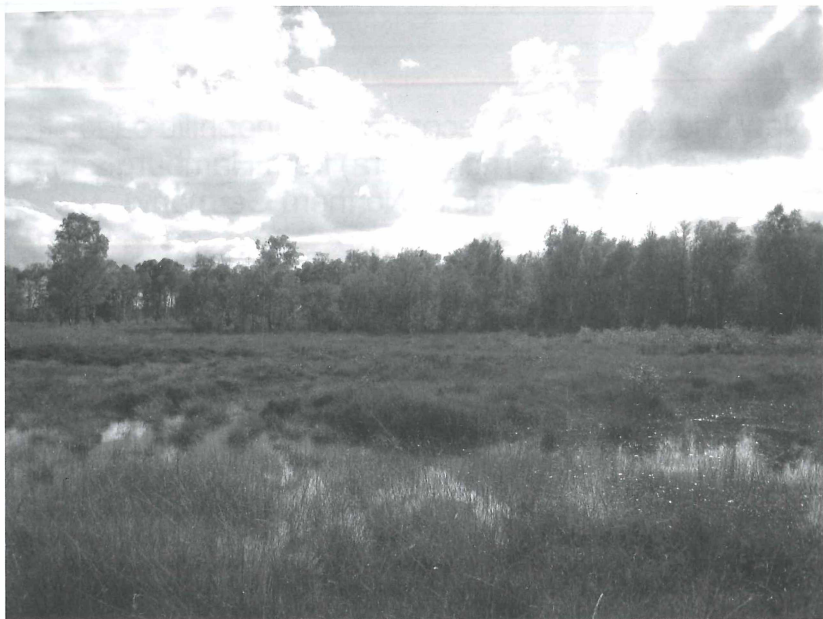
Fig. 1. Peat cut in regeneration stage at the Madenpohl area in the nature reserve Duvenstedter Brook (Hamburg).