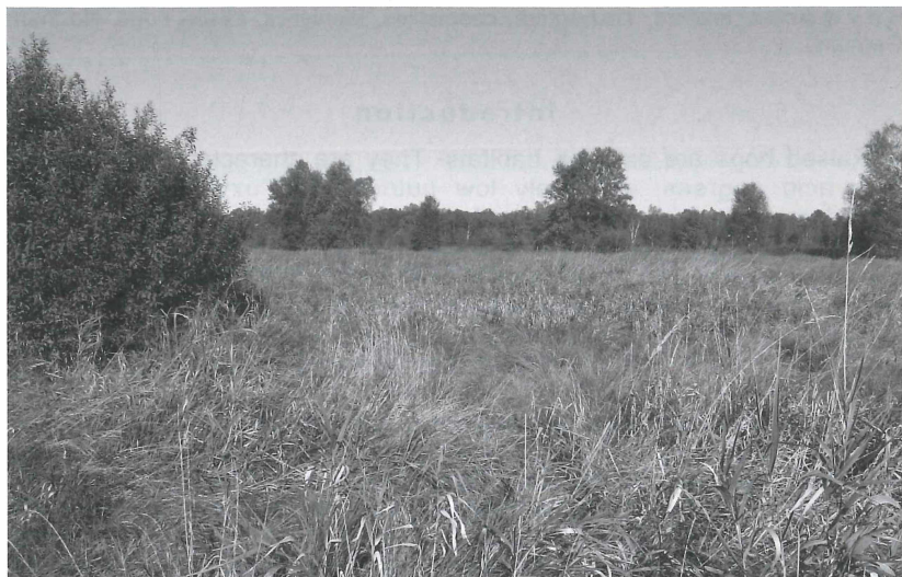
Fig. 2. The raised bog Herrenmoor near the village of Kleve (Schleswig-Holstein).