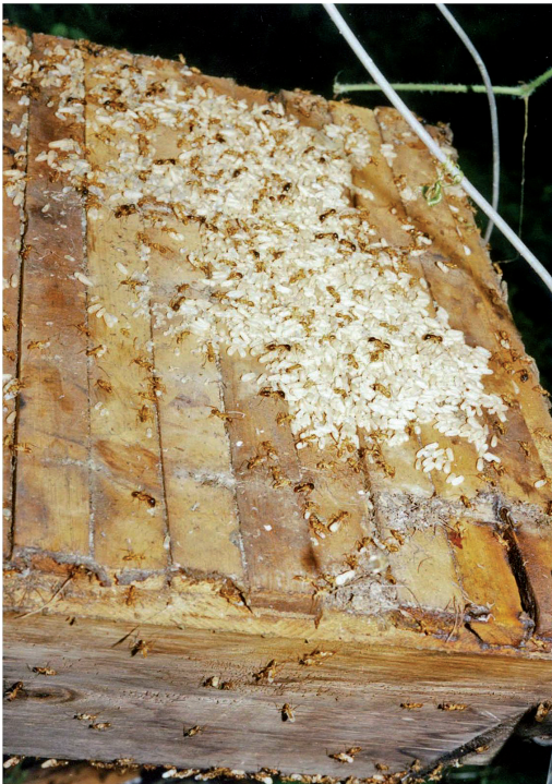
Fig. 13: Adults and pupae of the Larger sugar ant Camponotus maculatus on the top bars of a hive.

Abb. 12: Nest der Weberameise Oecophylla longinoda.