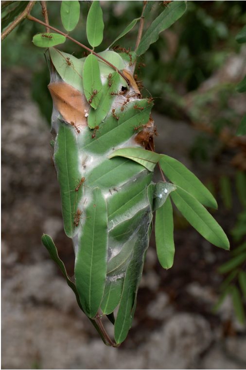
Fig. 12: Nest of the Tailor ant Oecophylla longinoda.

Abb. 12: Nest der Weberameise Oecophylla longinoda.