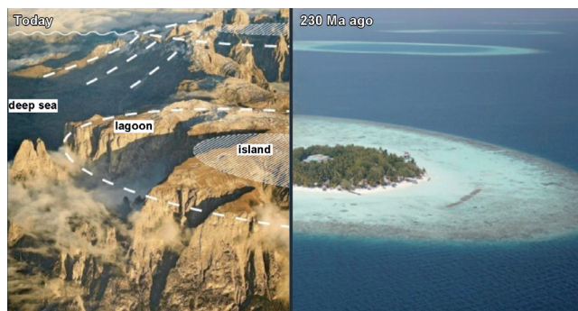
FIG. 2: Actualistic view of the Triassic atolls of the Dolomites (on the left, Sciliar at the close up), with the position of ancient coral reef, lagoons and the deep sea.