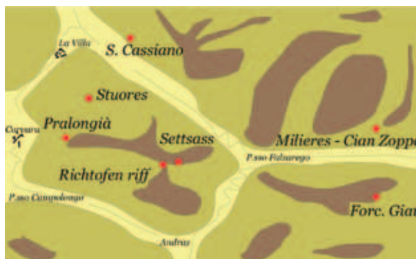
Fig. 2: Simplified location map of the fossiliferous outcrops (red dots) where vertebrate remains have been documented to date, Dolomites region, NE Italy.

Studied teeth are very similar to those of other sharks such as Acronemus Rieppel, 1982 or even Asteracanthus Agassiz 1837 and most of the characters that enable a clear distinction of these genera are found on the fin spine and cranium. Nevertheless listed characters allow to confidently attribute the specimens to the genus Acrodus Agassiz, 1838. Given the fragmentary nature of the studied material we prefer to leave the determination in open nomenclature.