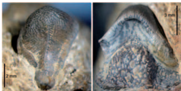
Fig. 1: The two Acrodus sp. teeth found at the base of the Richthofen Riff, near the Sieff camp (BZ). Acrodus represent a new taxon for the San Cassiano association.

The specimens are two domed, finely ornamented tooth crowns. Teeth are strongly arched in labial and lingual views. At least one lateral cusplet was clearly present although only half is preserved. A single, well marked longitudinal ridge runs across the crown. The crown is projected lingually. The ornamentation is finely reticulate. Crown is separated from the root by a band of vertical ridges. No expanded lingual torus is