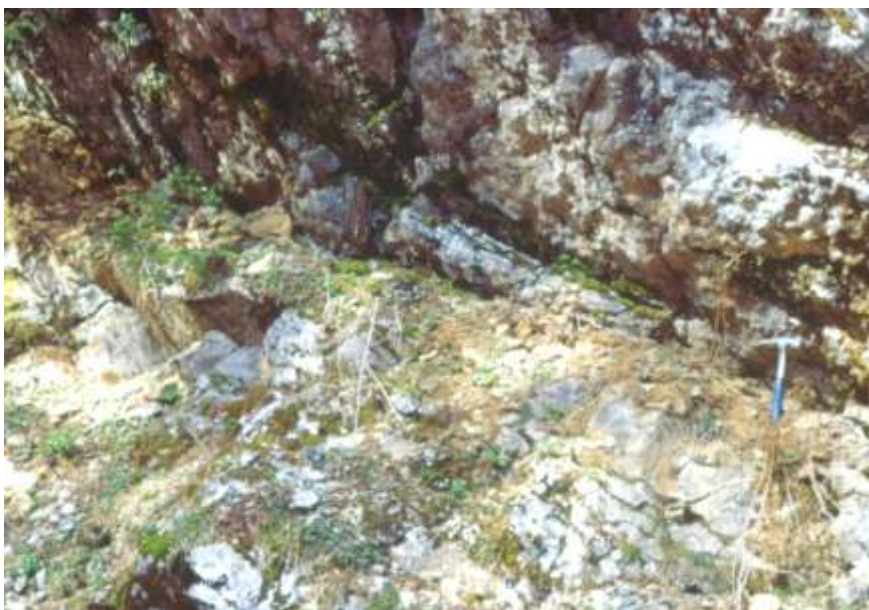
Fig. 2: Outcrop situation.

Concerning the palaeoenvironment of these Kössen-type intercalations within the Dachstein Limestone we assume, that local stagnant environments caused this type of slightly bituminous marly limestones. However, it cannot be ruled out, that the changing palaeogeographic situation close to the Tr/J-boundary was responsible for this type of sediments. Monotypical occurrence of Rhaetina gregaria near Knerzenalm may refer to "Rhaetina-Biofazies" sensu Golebiowski (1991) with brachiopods living on flat subtidal, and representing thus the shallowest Upper Triassic brachiopod facies. As to lithostratigraphy, Golebiowski's "Rhaetina-Biofazies" developed in the middle and upper parts of the Hochalm Member (Upper Norian).