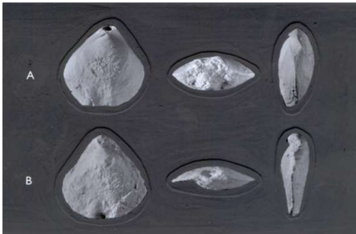
Fig. 3: A, B: Rhaetina gregaria (Suess). Knerzenalm. Magnified x 1.75.

Distribution: Norian and Rhaetian, common in the Kössen Beds. All literary data about occurrence in the Liassic rocks need modern revision.