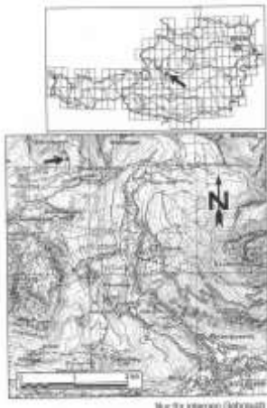
Fig. 1: Location of the sample point.

Our sampling at this locality yielded in the year 2002 except pelecypods not very well preserved terebratulids only, which all proved, based on the study of the internal characters, to be Rhaetina gregaria (Suess).