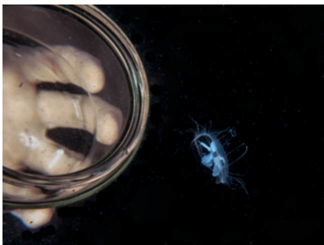
Fig. 3: One specimen of Craspedacusta sowerbii LANKESTER, 1880 being collected by Massimo Morpurgo on 23th August 2015 in the Large Lake of Monticolo / Montiggli (Photo Andrea Falcomatà).