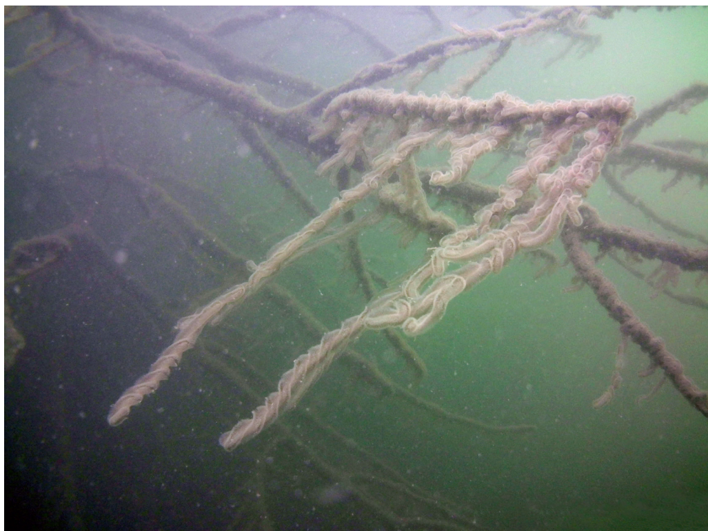
Fig. 3: Underwater picture of colonies of C. mucedo on submerged branches in the Large Lake of Monticolo / Montiggli at a depth of 4 m on October 3 rd , 2019. Numerous long colonies twisted between them forming cords up to about 40 cm long hung from the thinnest branches of the submerged tree. The cordons of colonies are arranged diagonally because they were moved by a light water current at the time of the shot.