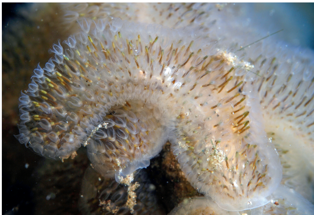
Fig. 1: Underwater macro photograph of a colony of Cristatella mucedo (about 3 cm in length) at 4 m depth in the Large Lake of Monticolo / Montiggli on September 26 th , 2019 (Photo by Massimo Morpurgo).

scuba dive computer Uwaterc Aladin Prime. Underwater macro photographs of bryozoans were taken with digital SLR camera Nikon D80 with 60 mm macro lens in underwater housing Sealux CD80 and one flash Sea & Sea YS-110 alpha in manual mode. Underwater wide-angle images and video were taken with an action cam GoPro CU-SPC05 with natural light. Colonies of bryozoans were measured underwater with a steel Vernier caliper in mm ( \pm 1 mm).