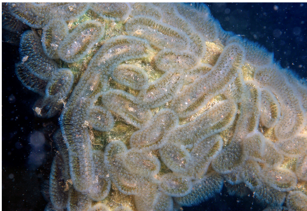
Fig. 2: Colonies of C. mucedo on a submerged branch at 3 m depth in the Large Lake of Monticolo / Montiggli on September 26 th , 2019.