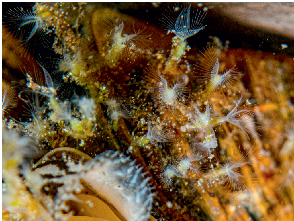
Fig. 5: Underwater macro photograph of Plumatella sp. on a zebra mussel Dreissena polymorpha at 2 m depth in the Large Lake of Monticolo / Montiggl on May 31 st , 2015 (Photo by Andrea Falcomatà).

It may be assumed that Cristatella mucedo is also present in other water bodies in South Tyrol. Further studies are required to be able to assess the actual distribution in the Province of Bolzano/Bozen.