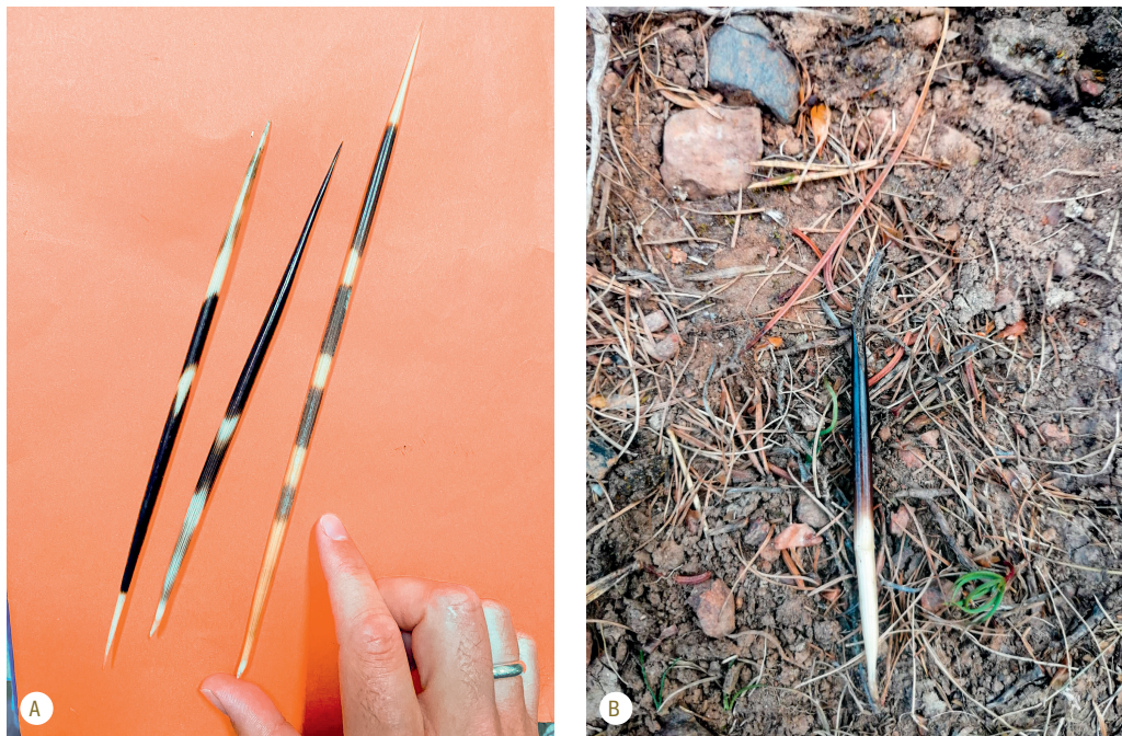
Fig. 1: A The quills found at the first location near Pfatten/Vadena. B. The single quill found in Villandro/Villanders at 1790 m a.s.l..