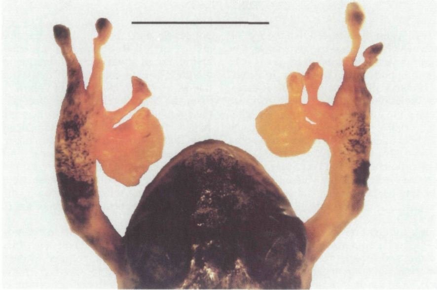
Fig. 1: Epidermal cysts of the first (innermost) digit of each foreleg in the Neotropical treefrog Hyla crepitans WIED-NEUWIED, 1824. Dorsal view. Bar represents 1 cm.

Abb. 1: Epidermale Zysten auf dem ersten (innersten) Finger beider Vorderextremitäten beim neotropischen Laubfrosch Hyla crepitans WIED-NEUWIED, 1824. Dorsalansicht. Balkenlänge entspricht 1 cm.