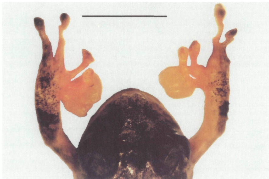
Fig. 1: Epidermal cysts of the first (innermost) digit of each foreleg in the Neotropical treefrog Hyla crepitans WIED-NEUWIED, 1824. Dorsal view. Bar represents 1 cm.

Abb. 1: Epidermale Zysten auf dem ersten (innersten) Finger beider Vorderextremitäten beim neotropischen Laubfrosch Hyla crepitans WIED-NEUWIED, 1824. Dorsalansicht. Balkenlänge entspricht 1 cm.