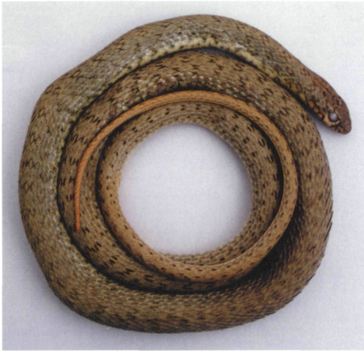
Fig. 3: Coluber (Hierophis) schmidti NIKOLSKY, 1909 from Jawa, Jordan (HLMD RA-2971).