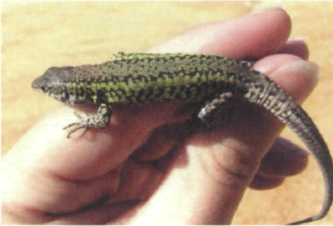
Fig. 1: Male Podarcis carbonelli PÉREZ-MELLADO, 1981 from Playa del Rompeculos, Andalusia, Spain.