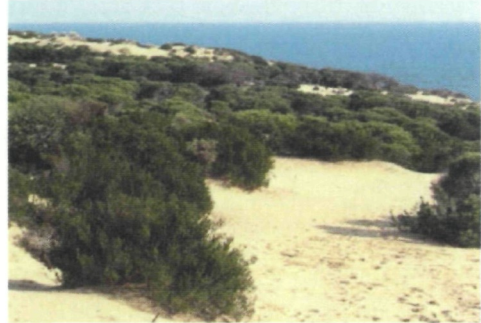
Fig. 2: Playa del Rompeculos, Andalusia, Spain, habitat of the male Podarcis carbonelli of figure 1.