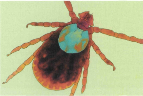
Fig. 1: Nymph of Haemaphysalis concinna from a lizard. The picture combines a photo taken in visual light, an auto-fluorescence photo (scutum), and a line drawing. Note the shape of the palps, of the scutum, and the festoons. Tick length: 1.4 mm.

(MALKMUS 1995). Nothing is known about the pathogenic potential of Haemaphysalis spp. to reptiles; yet the presence of unfed ticks only may be interpreted as a hint for the existence of a poor adaptation of this tick species to the reptilian hosts. Nevertheless, except for the unusual host spectrum, all other ecological parameters of our tick finding, like activity season, species distribution area, and microclimate, were within the typical range (NOSEK et al. 1967). The area of tick infestation on the lizards' bodies was restricted to the trunk close to the insertion of the anterior limbs. This may be due to the ability of lizards to detach ticks by feeding and by scratching with the limbs.