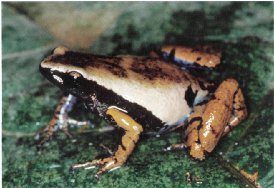
Fig. 2a: Adult male Cardioglossa alsco sp. n. (ZFMK 77678). Abb. 2a: Adultes Männchen von Cardioglossa alsco sp. n. (ZFMK 77678).