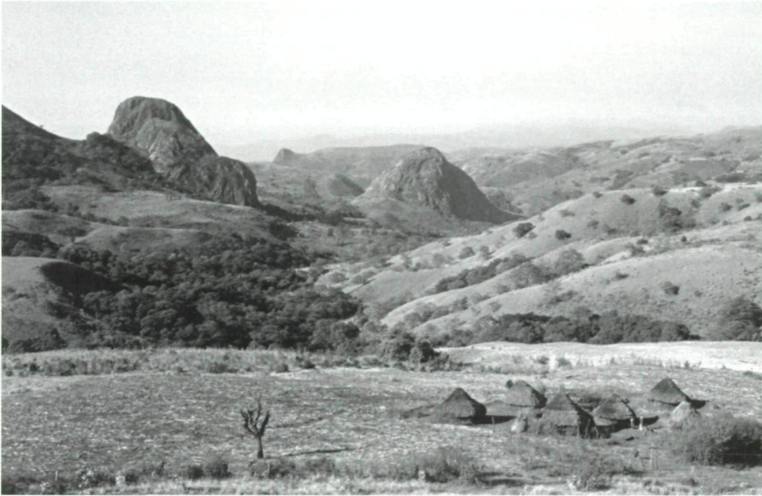
Fig. 3: Gallery forest habitat of Cardioglossa alsco sp. n. on the immediate southern side of the Tchabal Mbabo Mtns' rim.