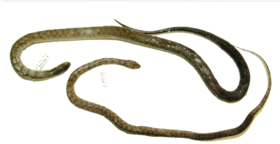
Fig. 2: The two voucher specimens of Amphiesma sarasinorum (BOULENGER, 1896) (NMW 22428:1, NMW 22428:2) in the Vienna collection that have most probably been collected by H. FRUHSTORFER at Mount Bawakaraeng (= Bua Kraeng), Southwest Sulawesi, in 1896.