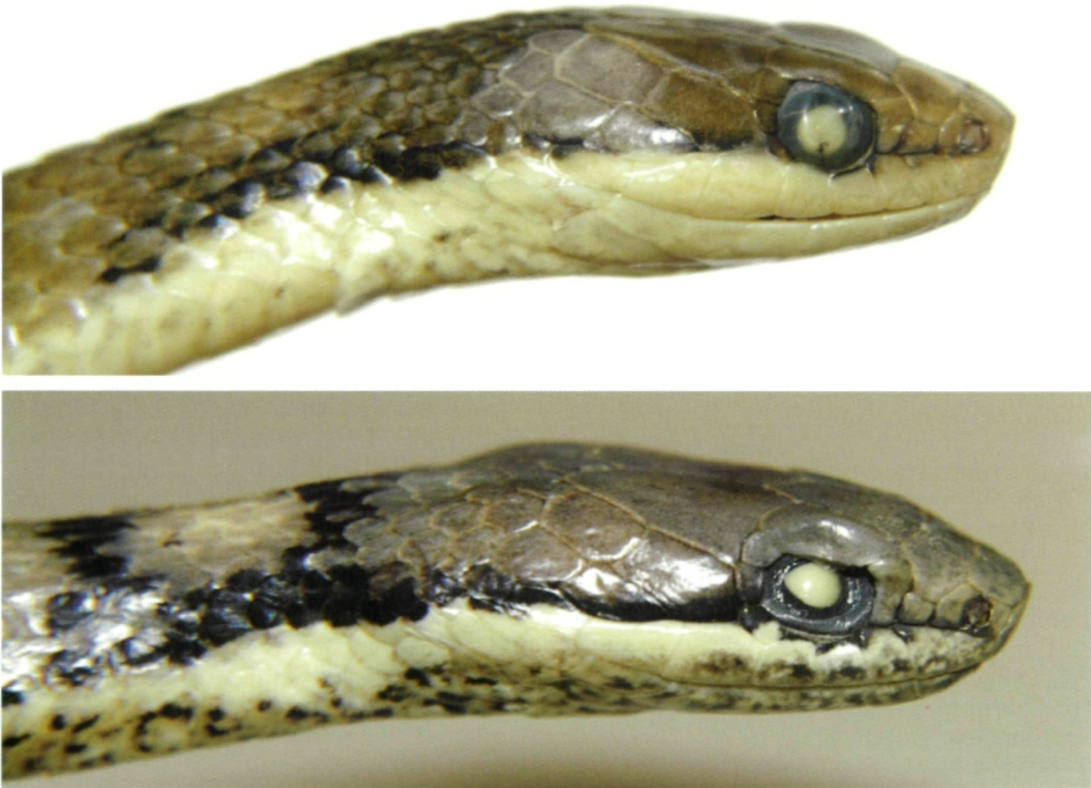
Fig. 3: Lateral view of the heads of NMW 22428:1 (above) and the lectotype NHMB 986 (below) of Amphiesma sarasinorum (BOULENGER, 1896). Note the slight differences in colour and pattern. (Photo: A. KOCH).