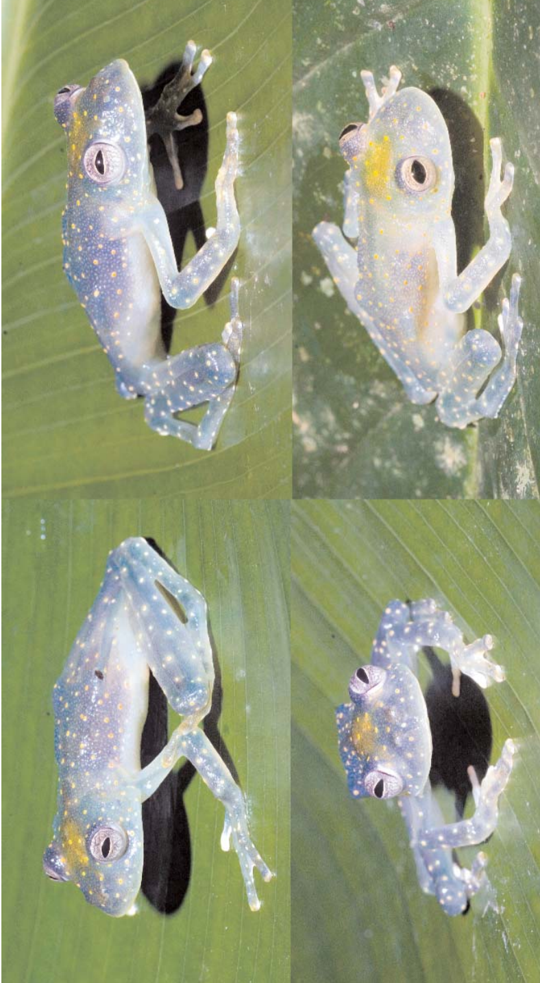
Fig. 1: Alive female Cochranella mache GUAYASAMIN & BONACCORSO, 2004 (DHMECN 3560) showing a blue dorsum with a yellow patch on the head and abundant small orange spots. Abb. 1: Im Leben zeigt das Weibchen von Cochranella mache GUAYASAMIN & BONACCORSO, 2004 (DHMECN 3560) einen blauen Rücken mit einem gelben Fleck auf dem Kopf und zahlreiche kleine orangefarbene Flecken.