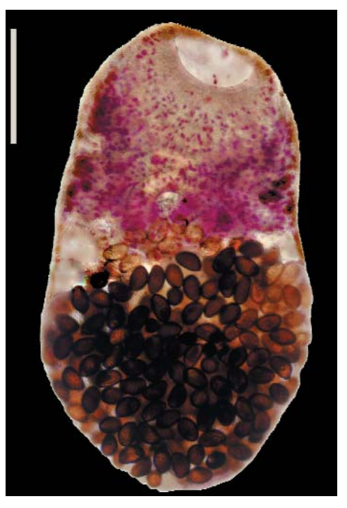
Fig. 2: Pleurogenoides sp., dorsal view, carmine staining, bar: 0.4 mm.

1964) even — observations, which generate the problem of the genuine host status of the taxons subjected to infection. In consideration of the known facultative progenesis of this distome (Grabda Kazubska 1976; Lefebyre & Poulin 2005), an alternative interpretation of the observations can be given: dragonfly larvae act as paratenic hosts (= a substitute of an intermediate host, in which no ontogenetic development of the parasite occurs), and a modified life cycle involving precocious metacercaria becomes operative immediately. Our case report may spotlight this topic — four hypotheses of ascending probability are addressed: