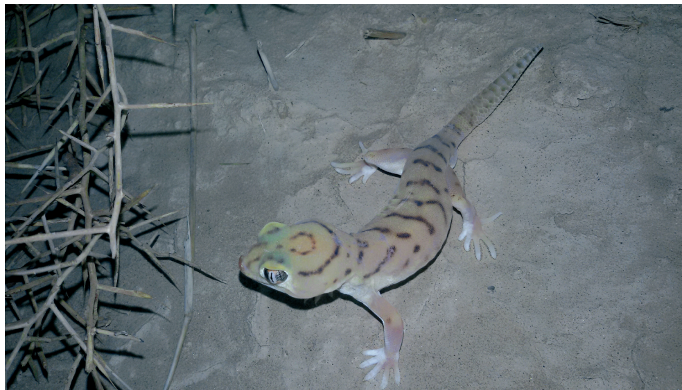
Fig.1: Teratoscincus microlepis NIKOLSKY, 1900 (HAC 63) in its natural habitat in the environs of the Village of Mir Ja'far Khan, 35 km east of Zabul, Province of Sistan and Baluchistan, Iran.