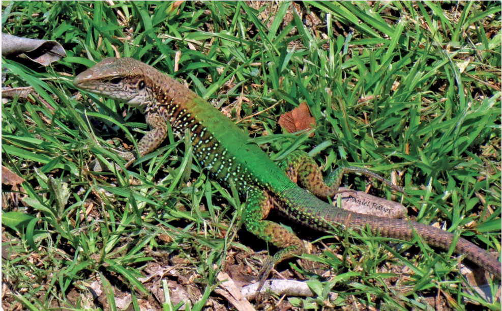
Fig. 1: Adult individual of Ameiva ameiva (LINNAEUS, 1758), at the Base de Estudos do Pantanal, Federal University of Mato Grosso do Sul, Corumbá, Mato Grosso do Sul, Brazil.