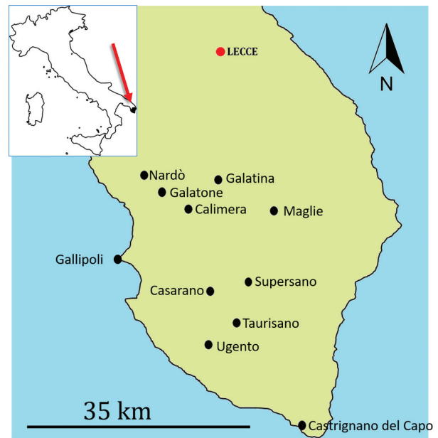
Figure 1. Distribution of the common chameleon in Salento (southern Italy) in 2018. Black dots represent observation localities.

Local interviews and field-searches revealed that the current distribution of the common chameleon in Salento (Apulia) ranges between the municipalities of Nardò and Castrignano del Capo (Fig. 1), improving previous knowledge on its range. We found no evidence of the presence of the chameleon in Salento during the XVII–XIX centuries (Costa 1871). The earliest recent observations of common chameleons in Salento date back to the 1940s, in the municipalities of Calimera, Martano and Maglie, according to local coalminers interviewed by one of the authors (RB). Other observations were made south to Lecce, in coastline areas covered with Mediterranean scrubland, between 1940 and 1970. In 1951, a dead individual was collected and stored in a glass jar with ethanol and exposed in a chemist's shop in Lecce (Appendix 2). Since the 1980s, records of the common chameleon have increased in the number of records and sighting localities (Basso and Calasso 1991; Fattizzo and Marzano 2002; Marzano and Scarafino 2010; Andreone et al. 2016).