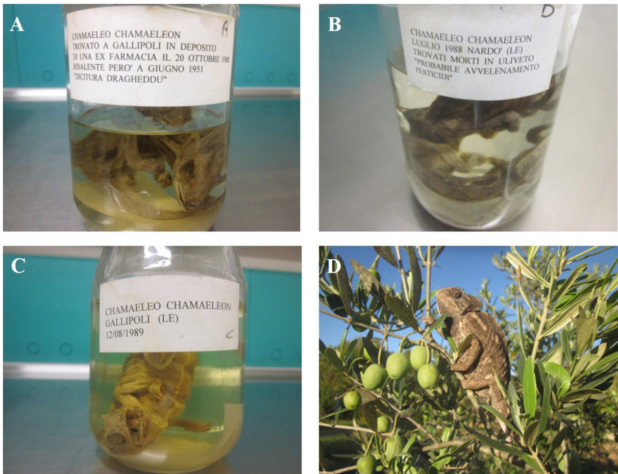
Figure S1. Samples of common chameleon used in our work. A-C) old samples stored at the Natural History Museum of Jesolo; D) a free-living female in an olive yard in the surroundings of Gallipoli.