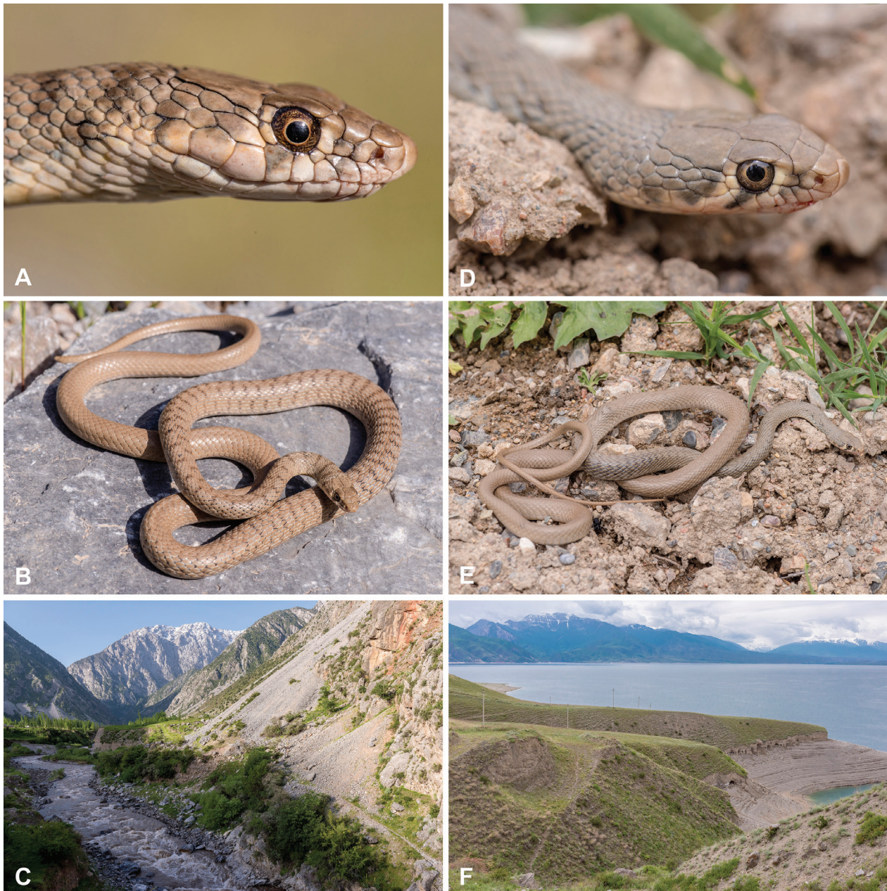
Figure 2. Platyceps rhodorachis from Kyrgyzstan: A-C. adult male from the locality Vidana, Osh Province and its habitat; D-F. adult female from Imeni Chkalova, Jalal-Abad Province and its habitat around Toktogul reservoir.