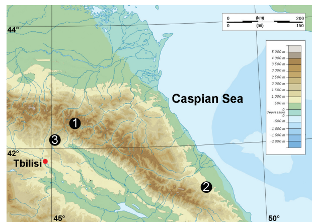
Figure 1. Locality records for lizards in the Caucasus: 1) Darevskia brauneri , vicinity of the Dzhvarboseli village. 2) D. daghestanica , Teng-Alty (=Tengyaalty) village. 3) Lacerta agilis and L. strigata , Tianeti village.

We recorded a previously unknown population of D. brauneri (Méhely, 1909) (Fig. 2) in the vicinity of Dzhvarboseli village, Kakheti, Georgia (42.4196N, 45.4953E; ~1930 m elevation) in the valley of the Tushetis Alazani River (Fig. 3). On the August 11, 2012 six specimens were collected at the edge of the forest (3 specimens deposited at ZISP, № 29863-29865; 3 specimens at the Institute of Zoology of Ilia State University, IZISU, not catalogued; coll. D. Bekoshvili). We measured a set of morphological characters (using digital calipers to the nearest 0.1 mm) to verify the taxonomic status of the population (Table 1). The closest known locality is the west in South Ossetia