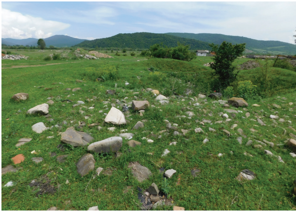
Figure 7. The valley of the Iori River in the Tianeti village.

(following the classification of populations of this species in the monograph Yablokov 1976), making this one of the rarest taxa in the genus Lacerta . In our opinion, the main natural limiting factors for this subspecies are the severe mountain climate and competition with L. strigata . We identified an anthropogenic factor causing destruction of its habitat, namely extraction of sand and rubble from the river valley. Due to its limited distribution and small population size, this lizard is very vulnerable and can rapidly disappear under adverse conditions. The effective method of protection could be the use of zoo culture and the creation of new populations through the reintroduction of captive bred lizards. Although this is a promising direction for protection of the herpetofauna (Ananjeva et al. 2015), we believe that the most effective conservation can be achieved through the creation of a protected area at this territory and a long-term monitoring of this population.