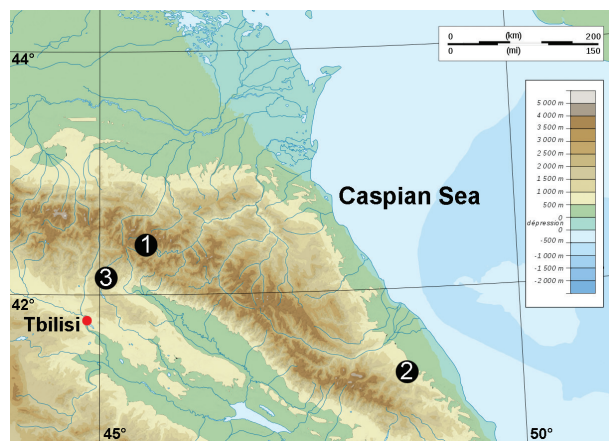
Figure 1. Locality records for lizards in the Caucasus: 1) Darevskia brauneri , vicinity of the Dzhvarboseli village. 2) D. daghestanica , Teng-Alty (=Tengyaalty) village. 3) Lacerta agilis and L. strigata , Tianeti village.

We recorded a previously unknown population of D. brauneri (Méhely, 1909) (Fig. 2) in the vicinity of Dzhvarboseli village, Kakheti, Georgia (42.4196N, 45.4953E; ~1930 m elevation) in the valley of the Tushetis Alazani River (Fig. 3). On the August 11, 2012 six specimens were collected at the edge of the forest (3 specimens deposited at ZISP, № 29863–29865; 3 specimens at the Institute of Zoology of Ilia State University, IZISU, not catalogued; coll. D. Bekoshvili). We measured a set of morphological characters (using digital calipers to the nearest 0.1 mm) to verify the taxonomic status of the population (Table 1). The closest known locality is the west in South Ossetia