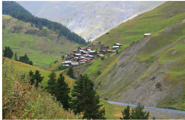
Figure 3. The vicinity of Dzharboseli village (photograph by A. Bukhnikashvili).

Because the systematics of the D. (saxicola) complex is controversial (Tarkhnishvili et al. 2016), it is necessary to compare the morphology of specimens from the western populations and new geographically remote population of D. braueri , to obtain genetic data. For this reason, we do not present here the definition of subspecies.