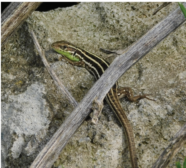
Figure 5. Lacerta strigata Eichwald, 1831, Tianeti village.

Note. L. (Longitudo corporis) – length of body from tip of snout to cloaca; L. cd. (Longitudo caudalis) – tail length: [–] tail regeneration or missing; Pil. (Pileus) – length from the tip of snout to the posterior edge of the parietal shields; Lt. c. (Latitudo capitis) – maximum width of head; Al. c. (Altitudo capitis) – head height near the occipital scales; Mas. (Masseteric) – the presence and size of the central temporal scale: [++] very large, [+] large, [(+)] mid-sized; Mas./Tym. (Masseteric/Tympanum) – the number of scales along the most narrow distance between the central temporal and drum scales; Sup. gran. (Supraciliary granules) – the number of granules between the supraoculars and superciliaries scales; Sup. (Supratemporalia) – the number of scales along the edge of the parietal shield for supratemporals; G. (Gularia) – the number of gular scales line between the middle of the collar and a compound mandibular scales; Sq. (Squamae) – the number of dorsal scales in a transverse row around the middle of the body; P. fm. (Pori femoralis) – the number of femoral pores; Pr. an.1 (Scuta preanalia) – the number of preanal scales in the front row; Pr. an.2 – the number of enlarged preanal scales.